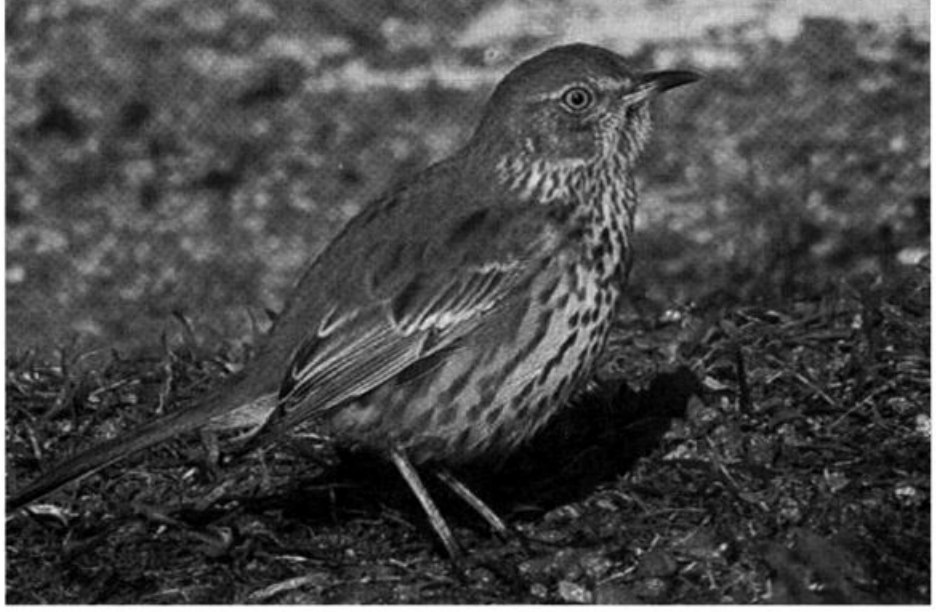
Maine's first Sage Thrasher at Cape Neddick, York, York County, was found 17 November 2001 (photographed here 18 November) and became the cause for pilgrimages by birders from much of New England and beyond.

observed at Plum I. (RH). The Sharp-shinned Hawk migration peaked 7-8 Oct along the s coast, with two-day totals of 2179 at Lighthouse Pt., CT and 254 at Napatree Pt., RI Napatree also had its one-day Cooper's Hawk high count (of 22) on 8 Oct, while 40+ were counted at Gay Head the next day (VL). The bulk of the Broad-winged Hawk migration was concentrated on 15 Sep in s. New England, with three Massachusetts watches topping 2000 and two Connecticut lookouts surpassing 5000 birds. A single juv. Swainson's Hawk was reported without details from Plum I. 16 Sep. Rough-legged Hawks apparently stayed to the n., with only 18 individuals found in their favored haunts in the Champlain Valley, one in New Hampshire, and 6 in Massachusetts Golden Eagles continue to appear in moderate numbers in the Region; this season's total was 14. A dark-morph Gyrfalcon was at Plum I 16-25 Oct, but no observers submitted details of their observations. The established population of Gray Partridge in far nw. Vermont reappears in these pages with a count of 12-15 in Alburg (F. Oatman, J. Wood). Only 8 Common Moorhens were located Regionwide, but one stayed into Dec on Nantucket. The Sandhill Crane that summered for the 3rd year in the n. Connecticut Valley was apparently joined by a 2nd bird, as the only report received from there was of 2 seen flying together 11 Aug (†J. Williams) Additional crane reports came from Massachusetts (2) and Connecticut (3).