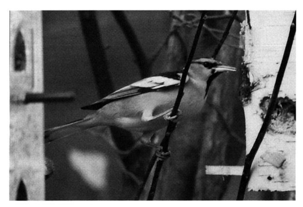
This adult male Bullock's Oriole at Ile aux Coudres 24-30 Nov+ (and probably earlier) provided a Regional first, previous provincial records having been of immature or female birds, which are confusable with pale Baltimore Orioles and with hybrid Bullock's x Baltimore Orioles. The pattern of vagrancy for this western species is likewise clouded in most of the East by these identification problems.

Hummingbird, Vermilion Flycatcher, Blackheaded Grosbeak, Brewer's Blackbird, and Bullock's Oriole all made an appearance.