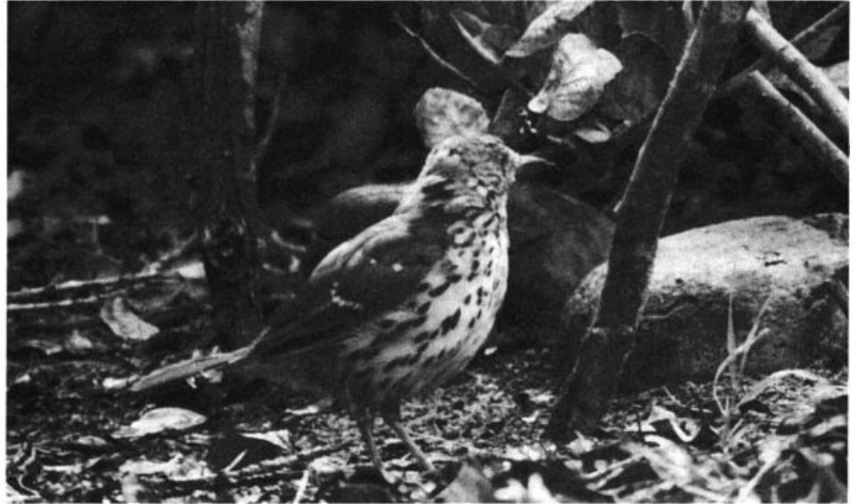
A Brown Thrasher at Cabrillo National Monument at the southern tip of Point Loma in San Diego on 9 August evidently spent most of the summer at this location.

An ad. Little Blue Heron in the Prado Basin,