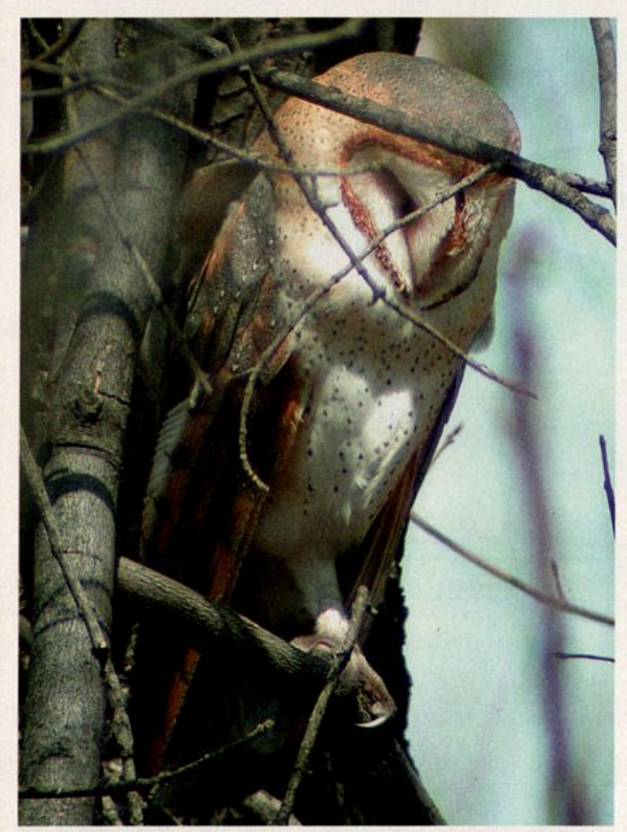
A Barn Owl present for one day 21 April at Île des Soeurs, Québec, attracted much attention. Although there are at least 50 records for Québec, this may be the only the second time this species has been photographed alive in the wild here. Very few birders from Montreal had seen this species in the province before this individual appeared, as most of the records are from farmers or of specimens found dead. The photograph was taken by digiscoping (to learn more, consult: http://www.vdn.ca/~ledy/portfolio1e.html).