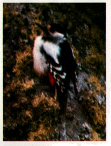
One of two recorded in spring 2001 in Alaska, this Great Spotted Woodpecker was noted 11 May on Shemya Island, Alaska. The other was much farther east on St. George Island five days earlier. These are the seventh and eighth individuals recorded in the state.