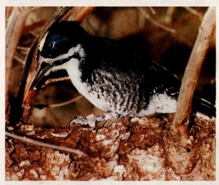
A long-staying male Black-backed Woodpecker delighted many observers at the Pocono Environmental Education Center in Pike County, Pennsylvania from 6 March to 16 May. It provided the second documented state record. This image was taken 29 April 2001.