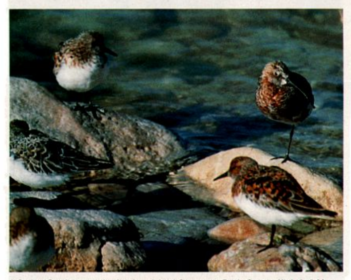
A Curlew Sandpiper at the Antelope Island Causeway, Davis County, Utah 6–8 May was the third state record for the species.