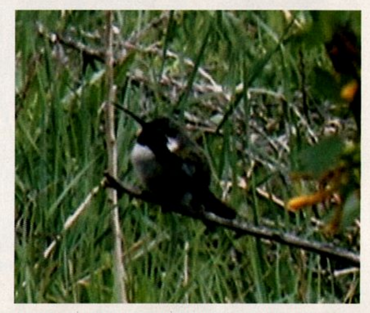
This male Costa's Hummingbird was Colorado's first at Crow Valley Campground, Weld County (photographed 17 May 2001).