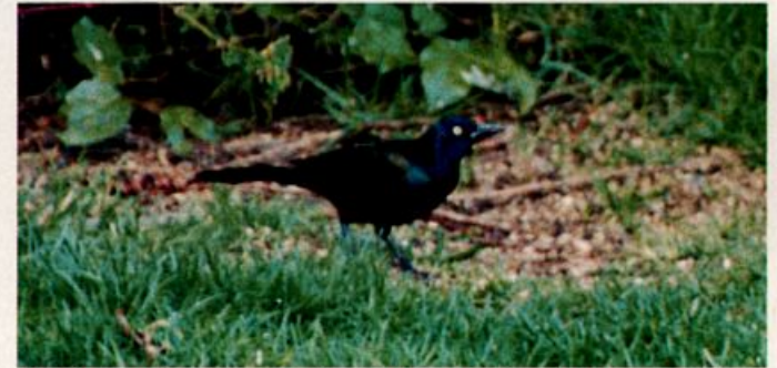
This Common Grackle, a species showing up with greater frequency in western states and provinces, was in Quatsino, north Vancouver Island, British Columbia, 20–24 April. This was the island's third record but first in spring.