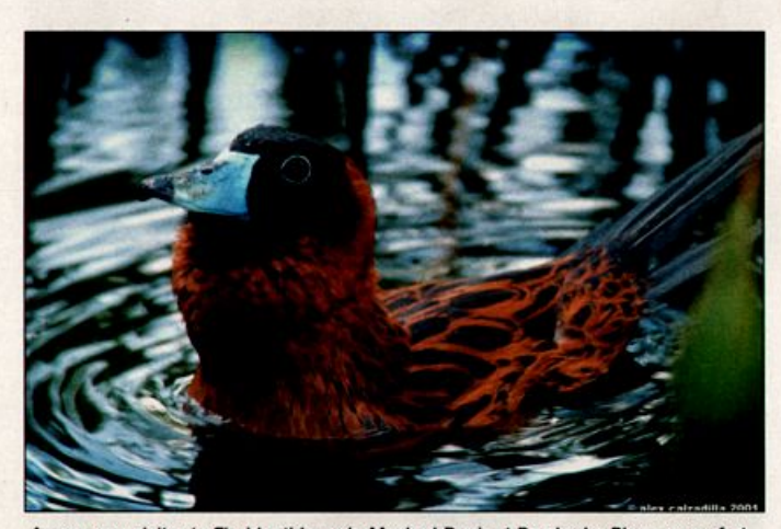
A very rare visitor to Florida, this male Masked Duck at Pembroke Pines, one of at least two discovered here 19 May, was photographed 9 June.