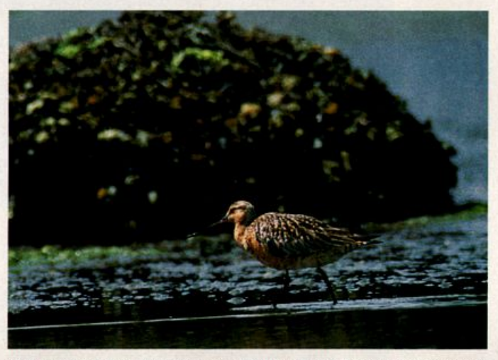
One Bar-tailed Godwit was among 100 Whimbrel in Tofino, west Vancouver Island 16–19 May. This is the second local record.