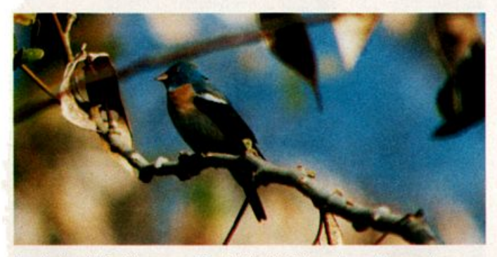
A male Lazuli Bunting, one of two in Florida this spring and a genuine vagrant in the East anywhere, frequented a very productive Mulberry tree at Fort De Soto County Park 18–24 April, the only previous record for Florida comes from 1977.