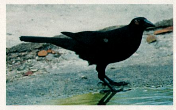
The West Indies' first Giant Cowbird, a female, was documented nicely on Barbados at Palm Beach 6 March 2001.