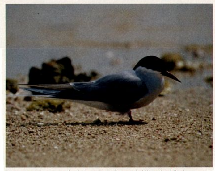
Among a great passage of pelagic seabirds documented throughout the Lesser Antilles, Bahamas, and Bermuda this spring, this Arctic Tem was captured on film 21 May on the beach at Guadeloupe.