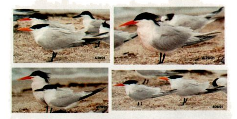
This adult Elegant Tern, thought to be the same individual as noted in December 2000, courted, then copulated with this female Sandwich Tern at Fort De Soto County Park, Florida 26 April 2001; the Elegant Tern had first been refound on 20 April.