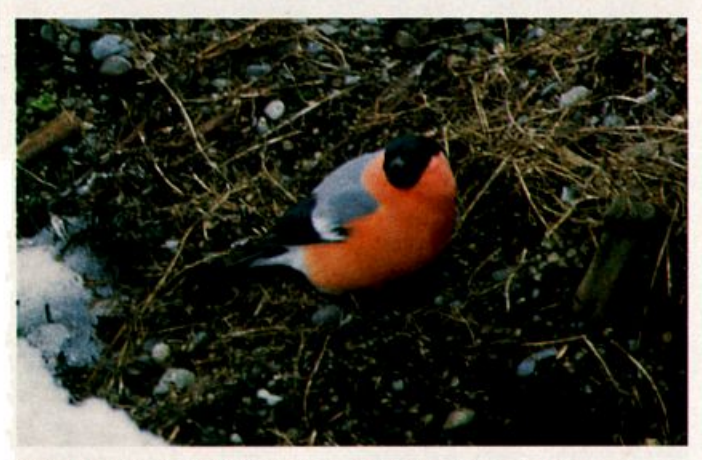
Birders touring Gambell, St. Lawrence Island, Alaska were welcomed from 28 May onward by this handsome male Eurasian Bullfinch that frequented the town's middens.