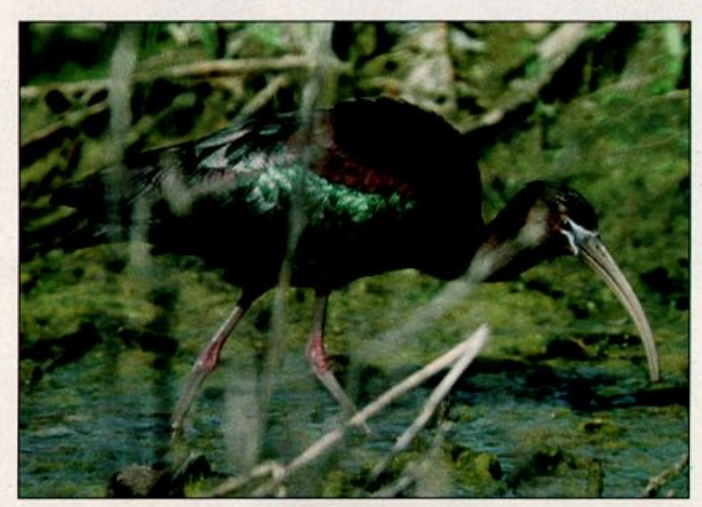
Northern California's first Glossy Ibis was in Alviso, Santa Clara County 14–15 May and in nearby Alameda County 20–21 May. It accompanied a major incursion of White–faced Ibis towards the coast and indeed a major flight of both dark Plegadis out of range in spring 2001. This photograph was taken on 15 May near the TiVo™ parking lot by the intersection of Highway 237 and Gold/Lafayette streets in Alviso.