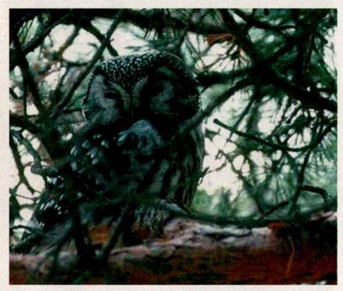
This Boreal Owl, banded at Presque Isle State Park, Erie, 7 April 2001, provided the first Pennsylvania record since 1896, when one was collected near Pittsburgh.