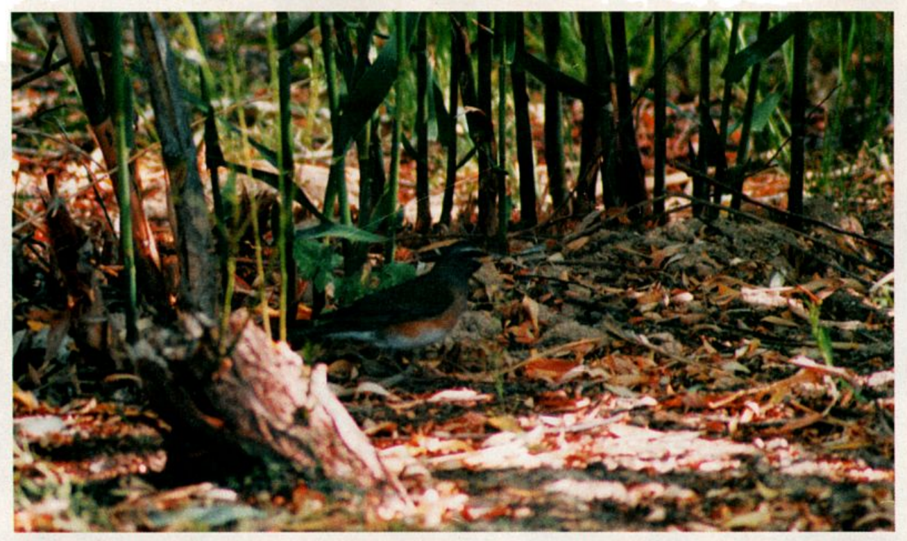
The first Eyebrowed Thrush in North America away from western Alaska shocked visitors to Galileo Hill Park, an oasis in the Mojave Desert of Kern County, in southern California on 28 May.