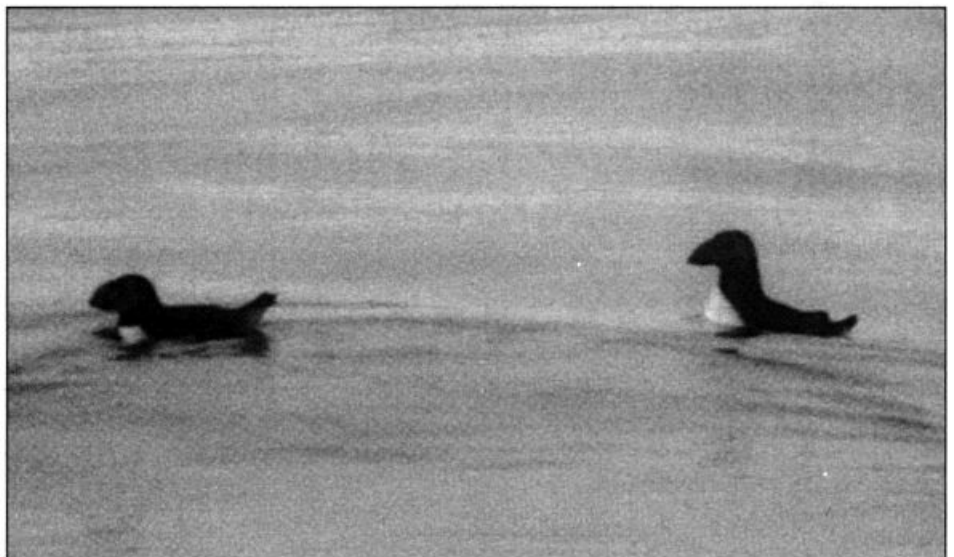
Two Atlantic Puffins, 60 miles east of Barnegat Inlet, New Jersey, were seen while returning from Hudson Canyon 26 May.