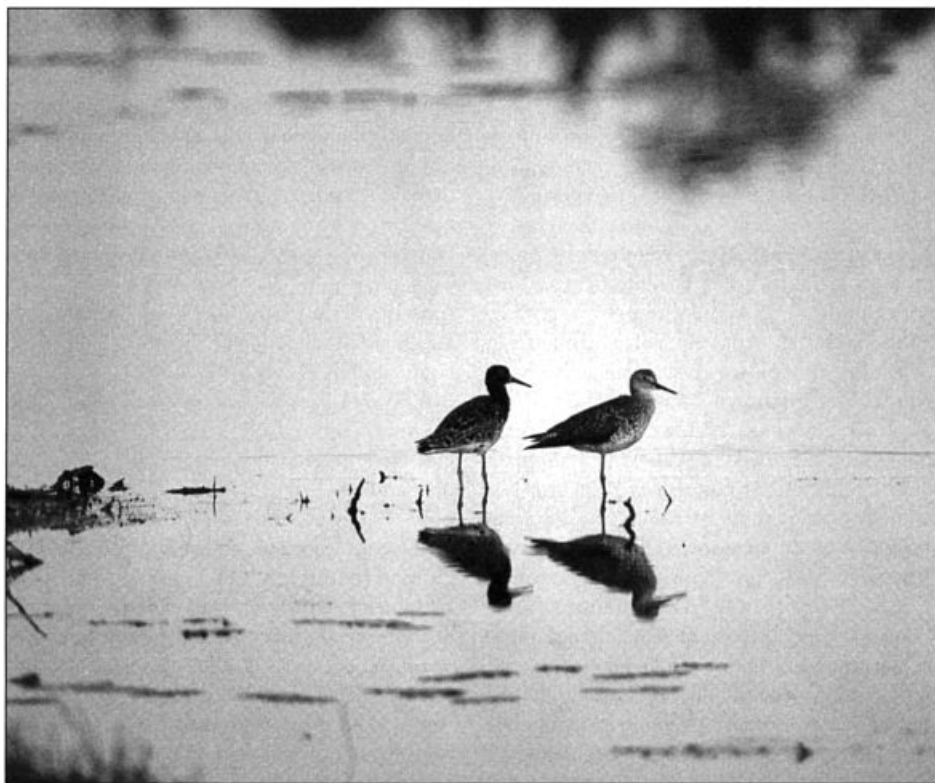
A Ruff at Southampton Township, Burlington County, New Jersey, photographed 27 May, provided the county with its first record.