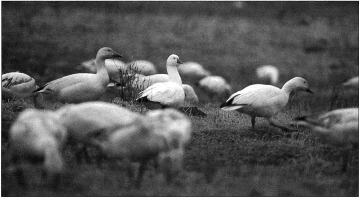
This is one of three Ross's Geese, near Sharptown, Salem County, New Jersey, photographed 9 March. The species continues to increase as a visitor to the East, South, and Far West along with the numbers of its congener Snow Goose.