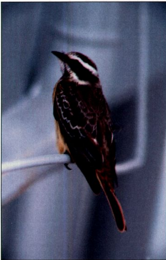
Last autumn's finest find in Texas may have been this Piratic Flycatcher, the state's second, on an oil rig off Kennedy County 21-22 October.