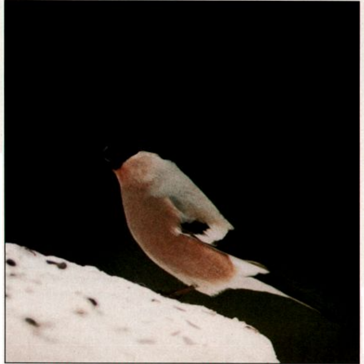
This female Eurasian Bullfinch of the cassini form (first described from Alaska) frequented a feeder in Fairbanks for 38 days beginning 24 February (here 6 March).