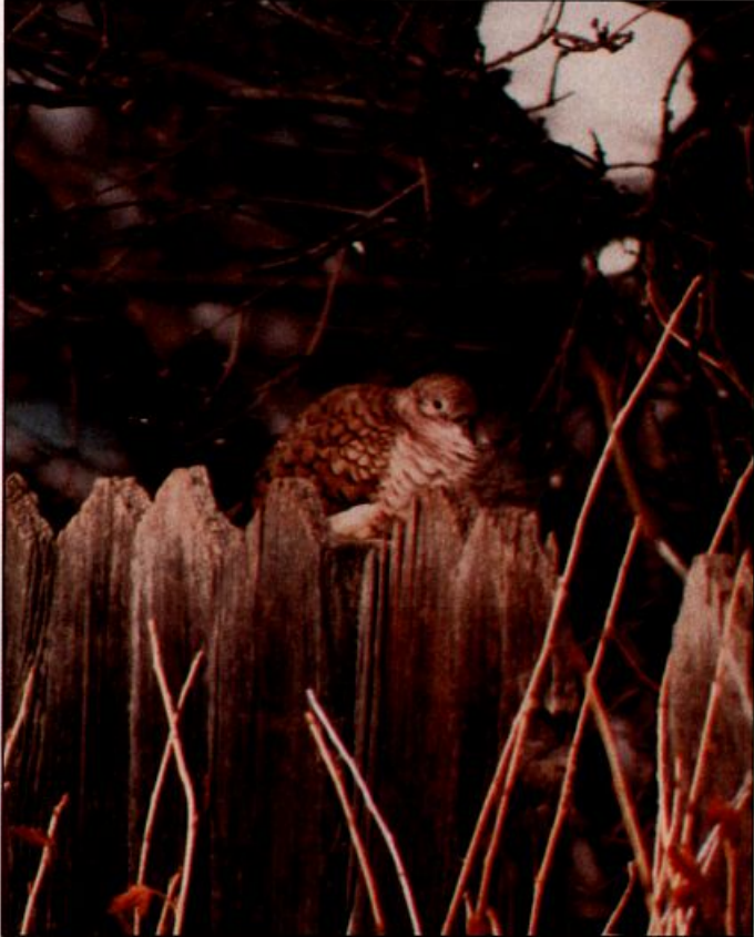
In addition to the now (apparently) resident birds in Rocky Ford, Colorado, another Inca Dove showed up this winter in Fort Collins, where it was photographed 18 January.