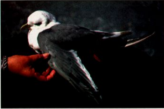
California's second documented Red-legged Kittiwake, an adult, was found alive 13 February in Ross, Marin County. In spite of diligent rescue efforts, it succumbed the next day and is now a specimen at the California Academy of Sciences. Another was noted just off Santa Cruz County about two weeks later.