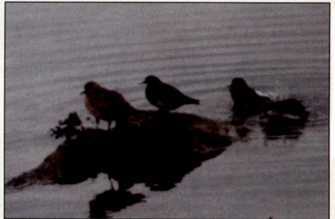
At Ketchikan, Alaska, it would be unheard of to see an American Golden-Plover or even a Pacific Golden-Plover in middle January, but a European Golden-Plover was completely unexpected. This bird was noted on Gauma Island near the airport there and photographed 13 January.