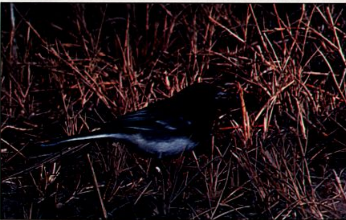
Part of a broad pattern of movement in the Southwest this winter, a White-winged Junco spent the winter near Bishop, Inyo County, California, establishing only the second record for the Southern Pacific Coast Region (and third for California) of this distinctive subspecies. It was photographed here on Christmas Day.