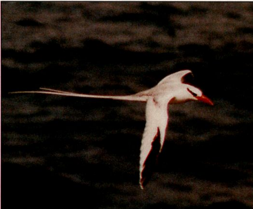
This Red-billed Tropicbird, a straggler to Hawai'i, was seen at Kilauea from 18 February through the period; it was likely the same bird as seen here in 1998 and 1999.