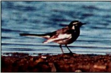
This adult Black-backed Wagtail frequented salt ponds at Alviso, Santa Clara County, California from 17 December through the period, a seventh Regional record and the first in winter. Incredibly, another wagtail, also thought to be a Black-backed, overwintered in Alaska!