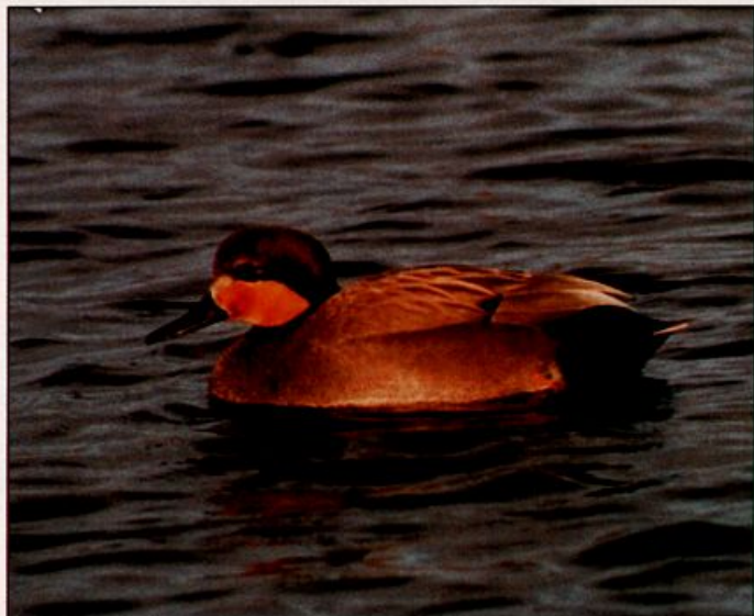
This "Brewer's Duck," as the hybrid Gadwall x Mallard was once known, appeared in Greeley, Colorado on 18 January (when this photo was taken) and remained until the 21st.