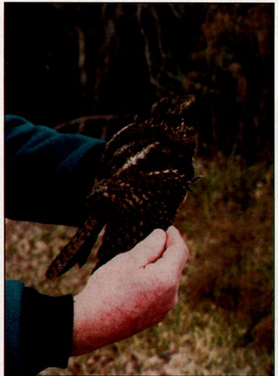
A female Chuck-will's-widow found in torpor on the Hatteras, North Carolina C.B.C. by Audrey Whitlock and Paul W. Sykes, Jr. 27 December provided firm evidence of the species's presence here in winter. The maritime forest of Buxton Woods lies in close proximity to the Gulf Stream, which provides enough warmth for a microclimate that supports often large numbers of warblers such as Ovenbirds wintering well north of typical range.