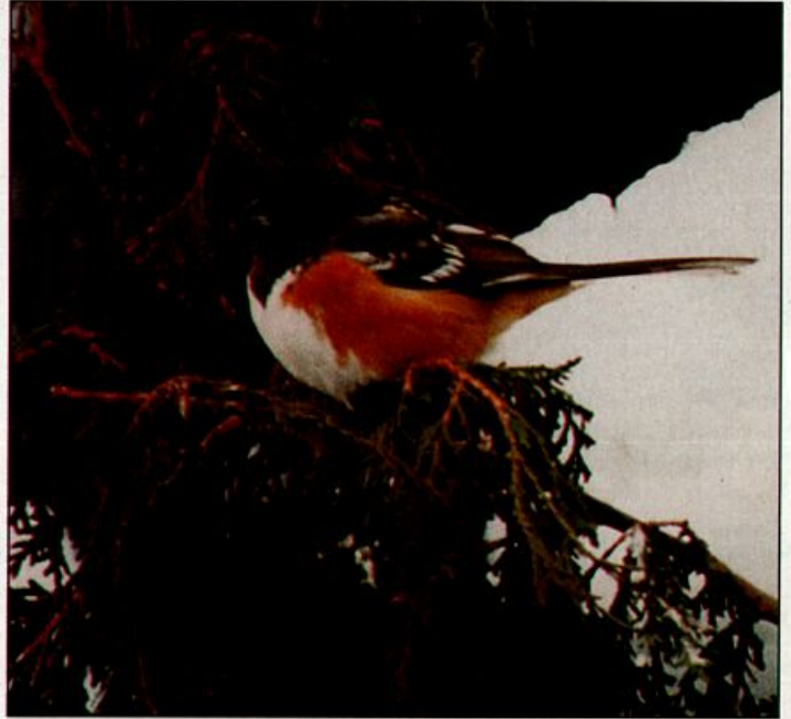
This female Spotted Towhee was seen by many observers at a Beauport, Québec feeder from 5 January through the winter's end.