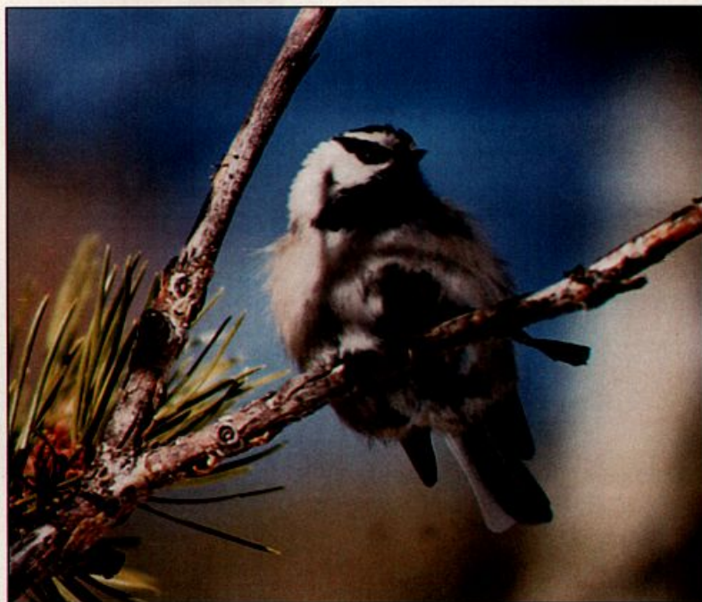
Mountain Chickadees dispersed widely from their montane haunts in the fall and winter, with records well into eastern Colorado, western Kansas, and the Great Plains generally, the Southwest, the lowlands of the Great Basin in Nevada, the Sacramento Valley, and the coast of Baja California. This individual was closer to home but smartly photographed at Allenport, Colorado on 20 January.