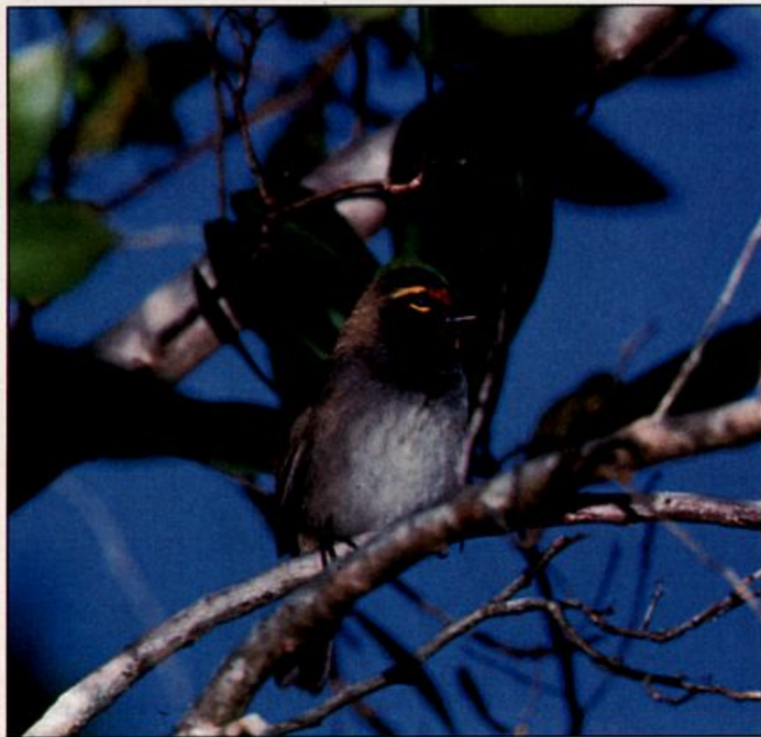
This male (West Indian) Yellow-faced Grassquit, a state fifth, was photographed at Eco Pond, Everglades National Park on 1 February 2001; it was present there from 20 January to 5 February.