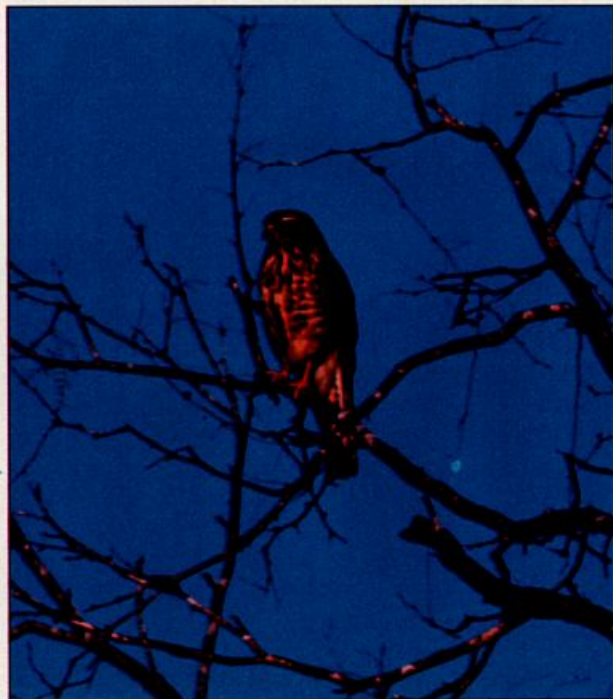
This Roadside Hawk, representing only the fourth for Texas (and the United States) was found 11 December at Bentsen-Rio Grande Valley State Park, when this photograph was taken, and reported infrequently through February.