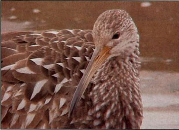
Appearing unexpectedly in the Mountain Region of Alabama, a Limpkin furnished a first state record at Smith Lake Park, Cullman County. Allowing study for nearly two months beginning 30 September 2000, the bird was photographed here 17 November 2000.