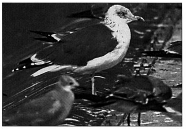
This adult Lesser Black-backed Gull was noted among others at Nassau, Bahamas, 18 December 2000.

Eastern Phoebes were good finds at Devonshire 30 Nov (DBW, ESB) and at Mid-Ocean Golf Course, Be. 22 Feb (IF, PW), but they were outdone by the continued presence of an Ash-throated Flycatcher at Southside, Be through Feb (MW, DBW, m.ob.). A Western Kingbird was noted at San Andros airport, Bahamas 23 Jan (SM), Five Western Kingbirds and 2 Scissor-tailed Flycatchers were at New Providence 17 Dec (AB, TG, LH, BH), a nice late-afternoon addition to the C.B.C. there. A single Loggerhead Kingbird was seen at San Andros airport 23 Jan. Cave Swallows (12) were seen near St. Marc, near Port-au-Prince, Haïti (JRC) on 24 Feb, but it is not clear whether they were resident or migrant birds. A Northern Shrike was found at the Bermuda airport 27 Dec and remained through Feb (SD). A Blue-headed Vireo was seen at Taino Beach, Grand Bahama 31 Jan, and another was seen at West End on 2-3 Feb (SM). A Yellowthroated Vireo near Stokes Point Nature Reserve, Be. was a good record 1 Dec (B&MS) The St. Lucia form of the House Wren was seen on 6 Dec (DC) near Chaubourg Forest Reserve. This pale-colored form has become very scarce and is considered threatened Golden-crowned Kinglets were noted at Port Royal golf course on 14 Jan (AD, BM) and apparently also overwintered at Spittal Pond, Be., where first found 30 Nov (ESB, DBW)