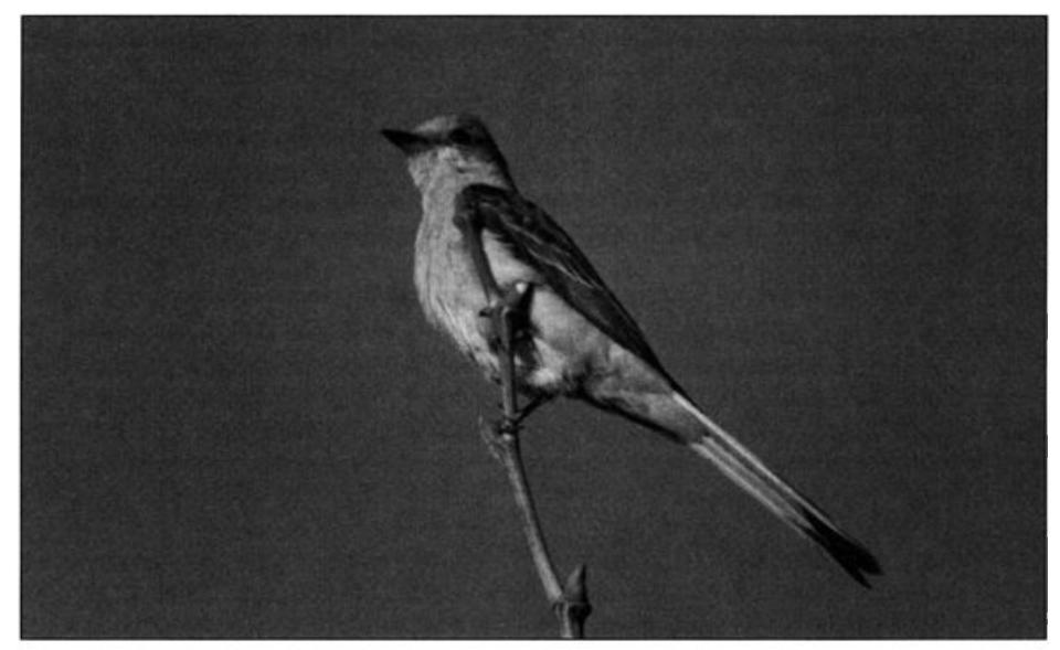
This is one of up to four Scissor-tailed Flycatchers found in Irvine, Orange County, California during the winter season, the Region's largest concentration ever. This photograph was taken 20 January 2001.