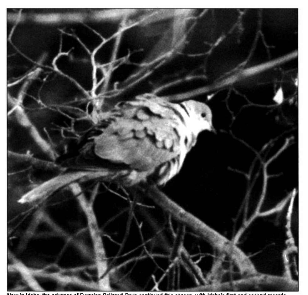
Now in Idaho: the advance of Eurasian Collared-Dove continued this season, with Idaho's first and second records established. This bird was one of three at American Falls, photographed 1 March 2001.