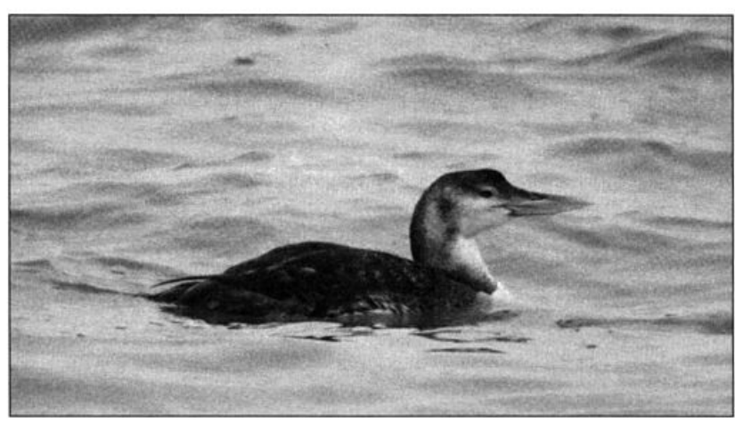
This Yellow-billed Loon near Port Isabel in southernmost Texas became a regular fixture after late February, providing a first Gulf of Mexico record.

Two or 3 Red-throated Loons were seen at two Trans-Pecos reservoirs periodically, most regularly at Imperial Res., Pecos (MAd et al.). At least 11 Pacific Loons were scattered around the state, mostly in e. and coastal Texas, but also including a bird at Imperial Res., Pecos and singles in the South Plains in Dec and Feb. A Yellow-billed Loon discovered by the Colleys in the Brownsville Ship Channel 22 Dec represented the 5th Texas record and a first for the Gulf of Mexico (ph., †to TBRC). The bird went undetected again until 25 Feb, when it began to be seen regularly. Although occasionally viewed from shore, regular boating trips were the best opportunity dozens of birders had to find this rarity; it remained through the season. A Red-necked Grebe provided a very rare Trans-Pecos record at Imperial Res. 22 Dec (M & AC). A great find by Noreen Baker and George Saulnier was a Red-necked Grebe on L. Austin, Travis 18 Dec-14 Jan, a first Austin record. Almost as rare was a Clark's Grebe in Lubbock 16 Dec (CSt, BPh). Numbers of both Clark's and Western Grebes are still on the increase in the Trans-Pecos: most unexpected were young Clark's chicks at McNary 14 & 17 Dec (ph. BZ). A Band-