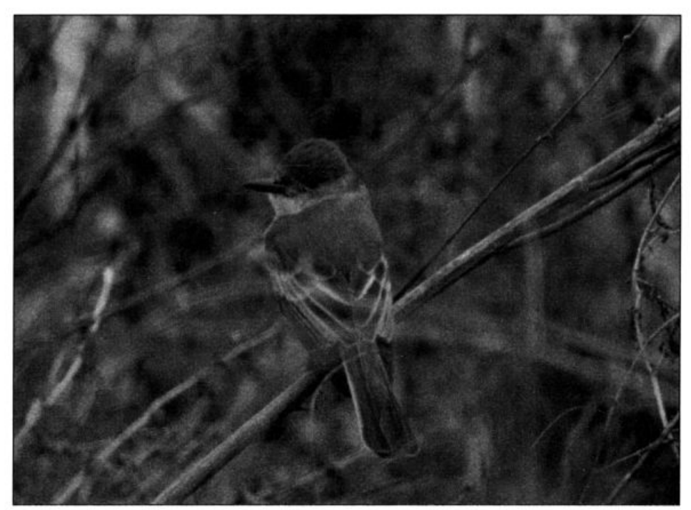
An Ash-throated Flycatcher at Quitman, Brooks County, Georgia, here photographed 18 January, provided the state's first fully documented record of the species.

Great Skua was again found off North Carolina, with 3 on the Hatteras pelagic trip 18 Feb (BP et al.). Unusual inland gulls included ad. Laughings at L. Allatoona, GA 1 Jan (JFl, EH) and High Point, NC 14 Dec (HH), an ad. Lesser Black-backed at Buford L. Dam, GA 21 Jan (EH et al.), and a Great Black-backed at West Point Lake, GA 5 Jan (fide JH). All Little Gulls reports came from North Carolina, as usual, with the best reports being 4 off Hatteras 18 Feb (BP et al.), 3 at Atlantic Beach 22 Feb (JF), and one at Wrightsville Beach 4 Feb (SCp). The C. Hatt. area once again hosted a good diversity of gulls. Highlights this season were a Black-headed 3-4 Feb (ED, DC et al.), up to 2 Californias during the winter (m.ob.), a record one-day total of 3-4 Thayer's 17 Feb (HL et al.), an ad. Iceland 17 Feb (HL et al.), a season-long, tame Glaucous (m.ob.), a Black-