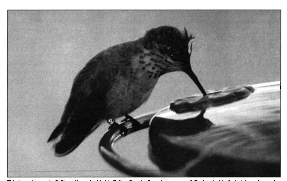
This immature male Calliope Hummingbird in Fulton County, Georgia was one of five banded in that state and one of at least 19 found far north found far north (and east!) of typical range this winter. This photograph was taken 18 December.

received, four in Georgia, and one each in the other states. In the amazing department, a Warbling Vireo was found to be wintering on Roanoke I., NC, this year, an unprecedented occurrence. One was found 12 Dec and seen off-and-on until the spring season (JL, JF). Even more amazing, a second individual was observed briefly 18 Dec! Common Ravens appeared at a new piedmont location in North Carolina when one was in Davidson 14 Dec (JPo); they are already at nearby Winston-Salem and Greensboro. Numbers of Redbreasted Nuthatches were down again this winter, with only a few scattered birds reported. Inland wintering Gnatcatchers seemed