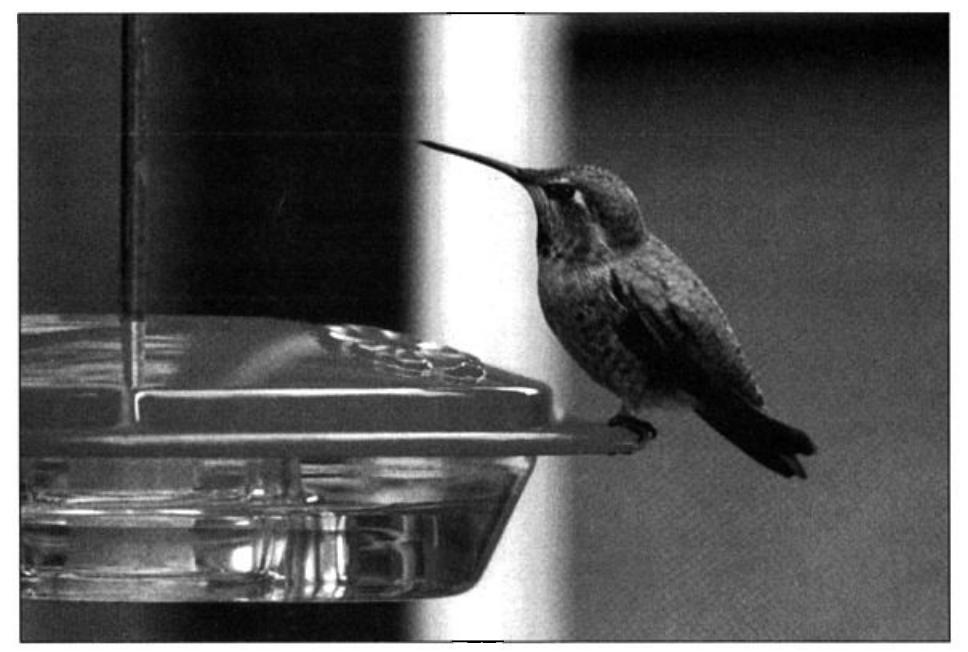
A female Anna's Hummingbird stayed at a Gwinnet County, Georgia feeder for several weeks. Geogia's third, it was captured on film 15 January.

considered a probable Acadian (PS et al.)! North Carolina's 3rd Vermilion Flycatcher from the fall at Goldsboro was last seen 2 Dec, right before the unusually heavy early snowfall the next day. Another Vermilion returned to Carter's Pond, Lakeland, Lanier, GA 28 Jan until at least 19 Feb (BBe, MB, sev. obs.) for the 2nd year in a row. Georgia had its 2nd and 3rd reports of Ash-throated Flycatcher, with one on the St. Catherine's I. C.B.C. 16 Dec (fide AW) and another near Quitman, Brooks 8–20 Jan (DG, DK, JFl, m.ob.). The latter bird was photographed, thus providing the state's first documented record. Western Kingbirds were found in all three states, with six reports