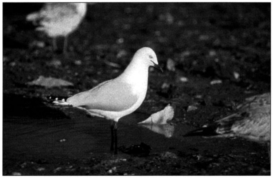
A Silver Gull, first noted in the autumn at Brown's Station Landfill, Maryland, has been presumed to be an escapee from a bird collection. This photograph was taken on 30 November 2000.