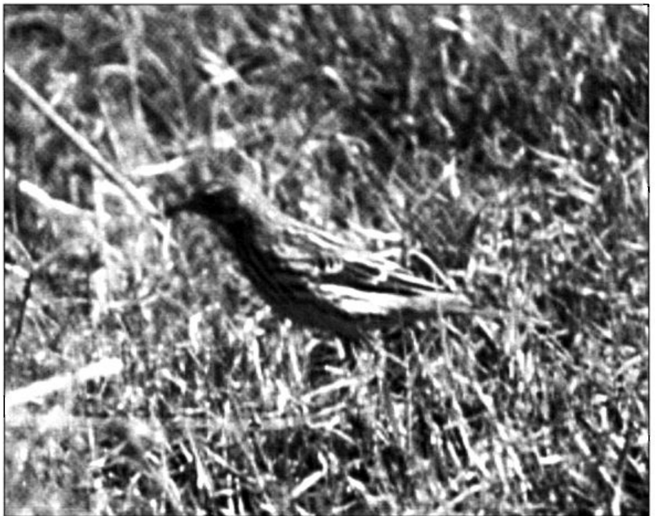
Surprising in a year when so few were found on the Pacific Coast, this first-fall Red-throated Pipit at Arroyo Santo Dominguito, Baja California, 7 October 2000, furnished the 8th record for the Baja California peninsula and the 10th overall for Mexico.