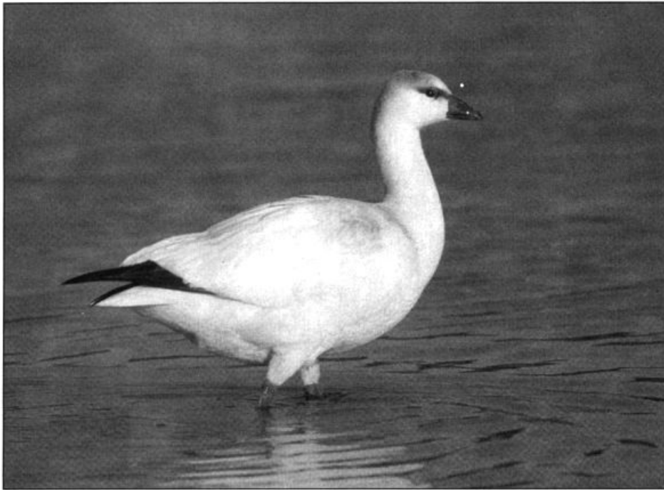
Steadily increasing as a winter visitor to eastern North America, Ross's Goose is now annual in much of the Northeast. This first-winter frequented Jamaica Bay Wildlife Refuge, New York, in October 2000.