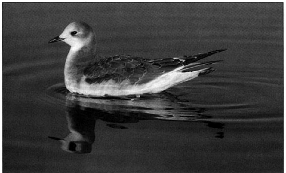
Only the 7th documented in New Jersey, this juvenile Sabine's Gull was seen by many at Merrill Creek Reservoir, Warren , New Jersey, 9–12 October 2000; this image was captured on the last day of its stay.

Two Caspian Terns at L. Carey 28 Aug (WR) provided a first Wyoming , PA, record, while 2 the same day over Hawk Mt. were a first there. About 4 Sandwich Terns reached L.I. 26 Aug–10 Oct at Jamaica Bay (ph. M. Stubblefield), while several at Cape May were more typical. Bridled Terns gathered offshore in unprecedented numbers, without storms. Five were out of Brielle, NJ, toward Hudson Canyon 2 Sep (FONT, PG, MV, MB et al.). On 3 Sep, two boats out of Cape May into Delaware waters counted 23 and 13, with little apparent overlap, feeding in sargassum weed in 80° water (FONT, PG, MG, ph. RW, m.o.b.). A White-winged Tern was discovered 2 Aug