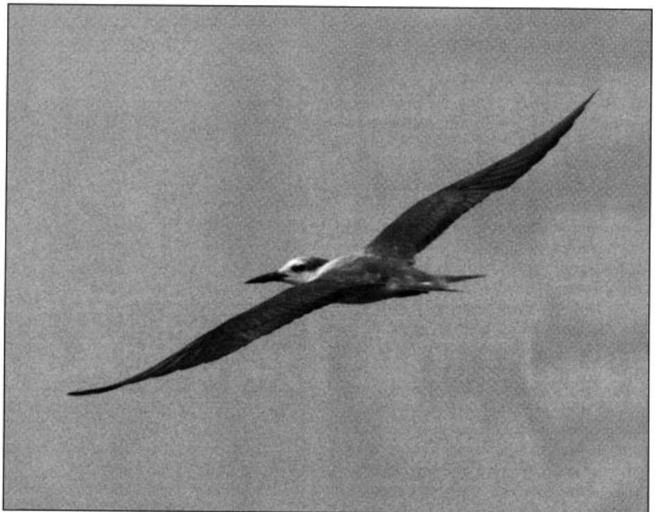
One of a remarkable 23 Bridled Terns off Cape May, New Jersey, 3 September 2000. The species is seldom noted so far north, particularly in such large numbers.