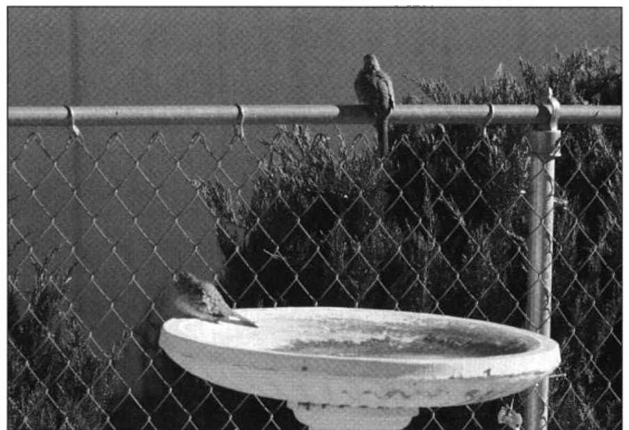
Like many columbids, the Inca Dove has been expanding its range in the past few decades, particularly in southwestern North America. These birds at Rocky Ford, Colorado, 12 May 2000 were two of up to five present through the summer.