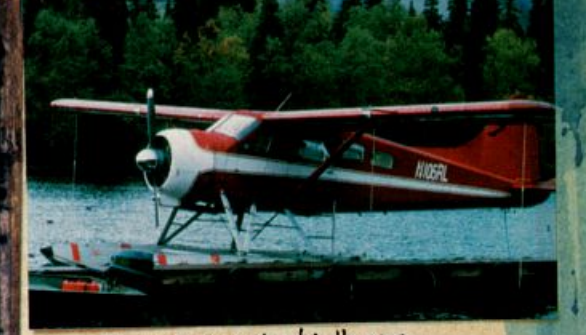
The only way to get a bird's eye view of Alaska. Note to self: Next time skip the Lumberjack Breakfast.

Extended Forecast: Rain, Wind, Sleet, Brrrr, Repeat.