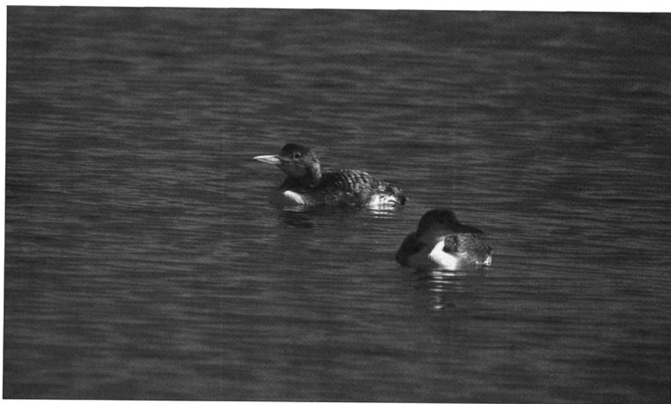
Posing as if to display their differences, this Yellow-billed Loon (left) and Common Loon (right) were photographed 16 April 2000. The Yellow-billed, a rare bird in the interior of the coterminous United States, remained on Big Johnson Reservoir near Colorado Springs, Colorado, 25 March–28 April.

at Soda L., WY, 29 May (CM). A Baird's Sandpiper was at Soda L., NV, 29 Apr (MM, GS). Single Short-billed Dowitcher were reported from S-Line Res. 26 Apr (TF, LN); several hendersoni were in Otero 21 May (CLW, TL, LSe) and in Weld 22 May (NK). Colorado's first known displaying male American Woodcock was at Rocky Ford S.W.A., Otero, 13 Apr–10 May (SO, m.ob.).