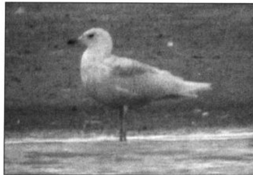
Field identification of Thayer's vs. Iceland Gull is hotly debated, as is whether these gulls are actually separate species. In the East, the problem is telling a Thayer's from a dark Iceland; in the West, the problem is reversed. Some birds in the West, however, are sufficiently pale to allow reasonably confident identification, such as this apparent Iceland (note the whitish wingtips) in Boulder during April 2000.

Hepatic Tanagers were reported from Prowers 14 May (DAL, CLW), Torrance Ranch, NV, 16 May (KV), and Pueblo 19 May (CLW, TL). A male Scarlet Tanager in the S.L.V., Rio Grande , 20 May (JJR) was most unusual; others included singles in Baca , Pueblo , Prowers , and at C.V.C.G. The wintering Eastern Towhee at Penrose, Fremont , stayed to 16 Apr (RWa, JW, m.ob.). A Cassin's Sparrow was n. of normal at Torrington, WY, 21 May (CM). A Black-chinned Sparrow at Tonopah, NV, 3 May (JB) was also unusually north. Single