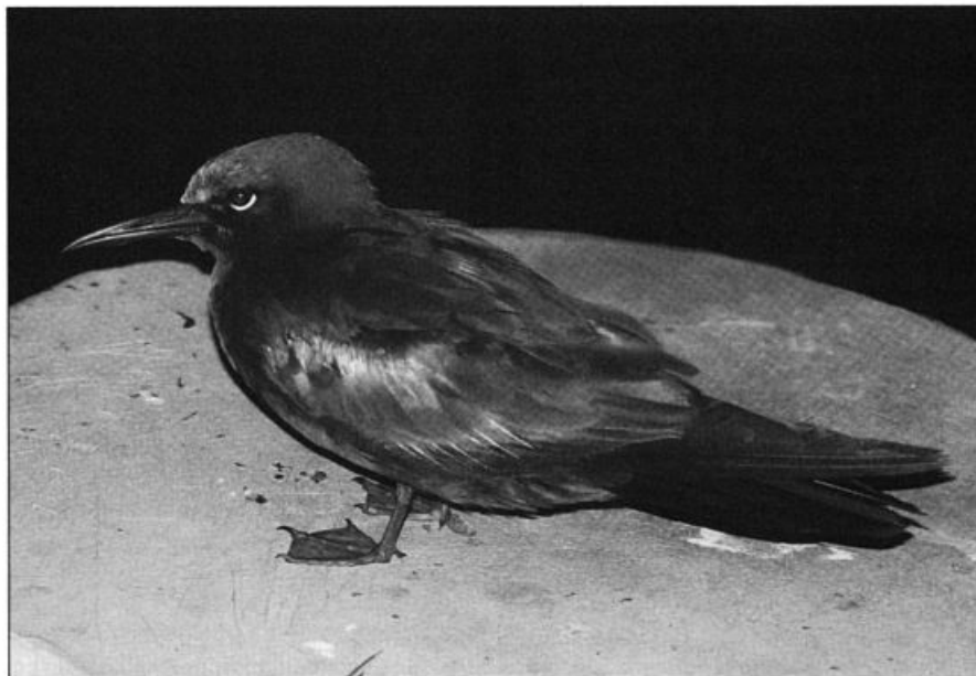
Yet another amazing find on an offshore oil platform was Texas' seventh Brown Noddy. This apparent subadult was captured on film the second day of its 27 April–1 May visit to the platform.

After the 1 May storm, 21 warbler species were detected in the cen. Brazos Valley. Substantial inland tallies included 50 Tennessees in Longview 28 Apr and again 2 May (GLu et al.), 50 Magnolias 2 May in Nacogdoches (DW), and 45 Black-throated Greens 1–2 May in w. Bexar (ML). Launching into a long list of interesting warblers, we had: Blue-winged at Big Bend 11 May (RHe); Golden-winged at Lubbock 23 Apr (AF), Amarillo 2 May (RSc), and Balmorhea 20 May (RD); Tropical Parulas in Calhoun , 5 Mar (PH, BrF), at High I. 12 Mar (DVe), 3 on the Devil's R., Val Verde , in late Mar (TG, EB), at Hill Country S.N.A. 6 Apr–21 May (ML et al.), and at Big Bend's Sam Nail Ranch 19–20 May (DKa et al.); Black-throated Blue at Lubbock 23 Apr (AF), the Davis Mts. 26 Apr & 18 May (LyB, B&MW), and Big Bend (Panther Junction) 18–21 May (m.ob.); Townsend's at High I. 23–25 Apr (KeH, KG et al.); at least 11 Hermits in the Chisos Mts. 20 Apr–13 May and one in the Davis Mts. 23 Apr (MAd, KB); Blackburnian in the Davis Mts. 22–23 May (WF); Yellow-throated at Big Bend 18 May (RD) and Midland 29 May (DK); Prairie at Lubbock 13 Apr (JB); Palms at Big Bend Ranch 28–29 Apr (JDa) and Lubbock 10 May (RKO); a Cerulean at Dallas in early May (KC) and a remarkable 9 in Bastrop 3 May (BrF); Prothonotaries at Lubbock 8 Apr (AF), Panther Junction 16 Apr (MF), Balmorhea 20–26 Apr (BBE, TJ), and Sam