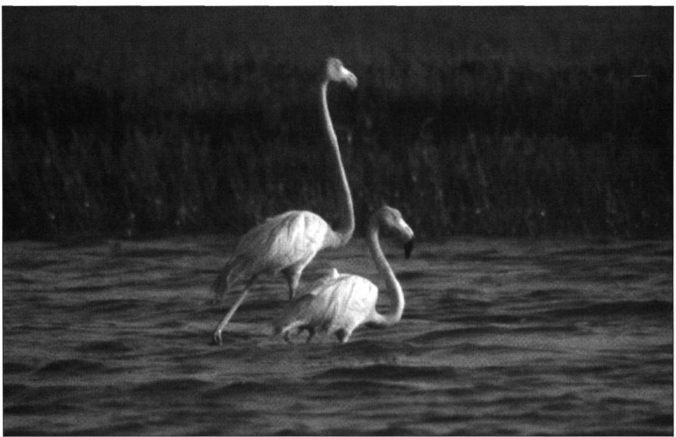
Greater Flamingoes generated excitement in Texas, for they were believed to be wild strays from the Caribbean, the second such occurrence in the state. Through much of spring 2000 these two frequented Aransas Bay, where this photograph was taken 7 May. See the S.A. in the Texas region for details.

at S.S.W.T.P., Dallas (BSt), and 25 May at Waco (FB, JMu). A concentration of 150 Wood Storks at Falcon Dam 28 May (MA) was an early vanguard of things to come in the summer, perhaps an indicator of drought in Mexico. Two Black Vultures along the Rio Grande in Hudspeth 9 Apr (JSp, JPa et al.) provided a rare record for that area.