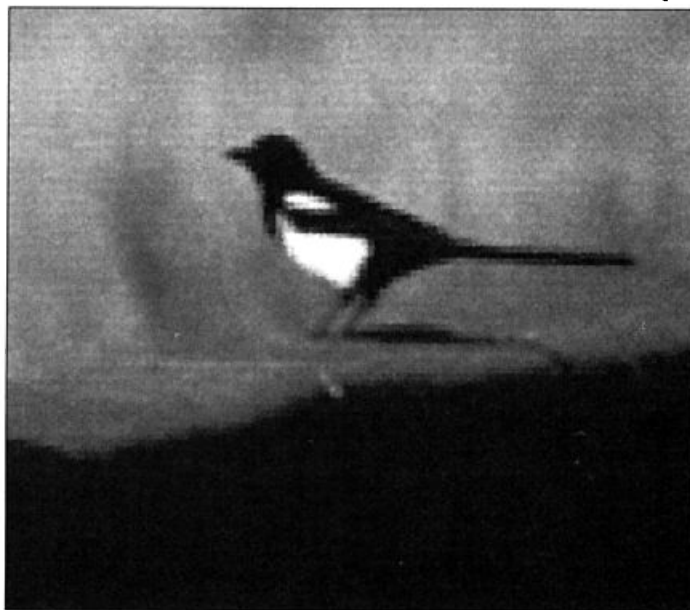
In spite of populations just across the state lines of Oklahoma and New Mexico, the Black-billed Magpie rarely ventures into Texas. One discovered in Hansford 5 Dec 1999 provided only the third record for Texas. This photo was taken 7 Dec and as many as three birds were present through the winter.