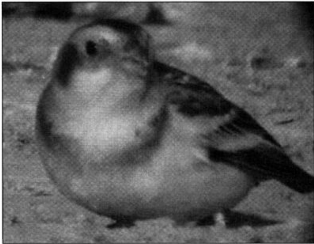
Not surprisingly, Snow Buntings seldom wander as far south as Texas. The state's fifth was this first-winter male photographed the first day of its 26–29 Dec visit to Lake Tawakoni, Rains.