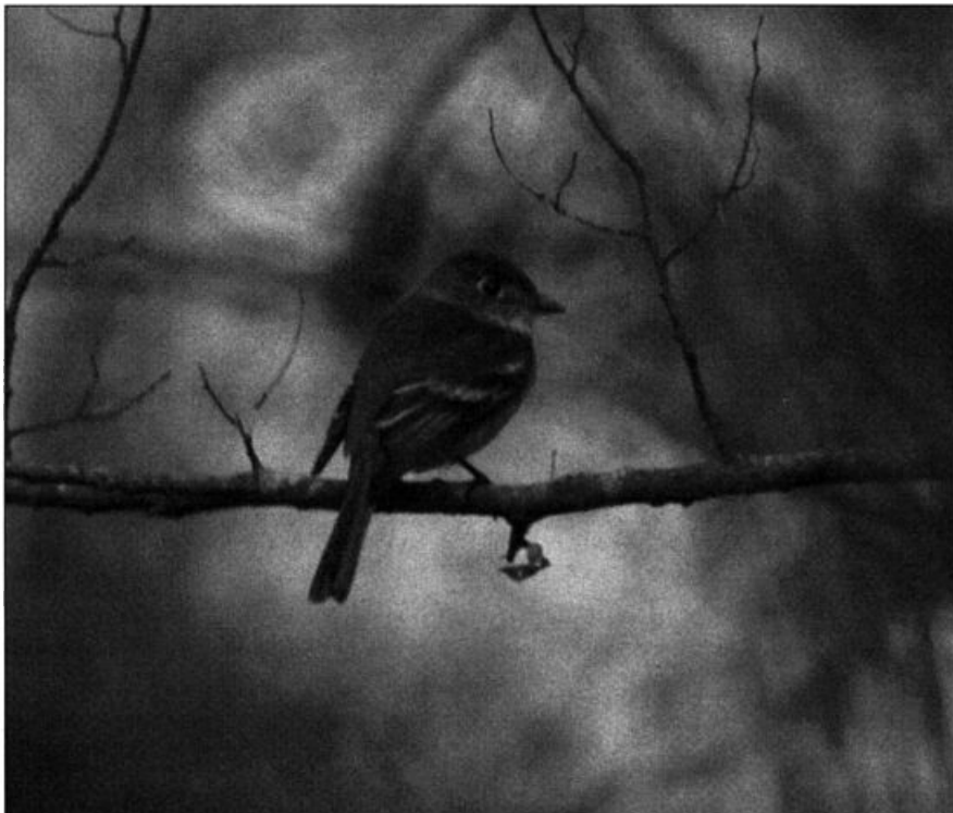
Scarce in the United States in winter, this Least Flycatcher at Plaquemines, Louisiana, 20 Feb obliged observers with calls.