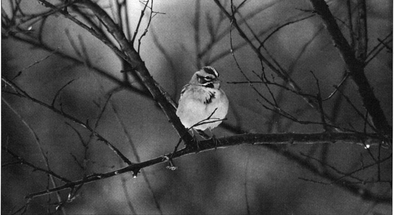
This lovely Lark Sparrow was photographed during the first day of its two-day visit to LeFlore, Mississippi, 28–29 Jan 2000.

in the following fine banding totals: Ruby-throated (8), Black-chinned (14), Calliope (2), Broad-tailed (1), Rufous (15), and Allen's (1). Mississippi hosted two Broad-tailed Hummingbirds, one each in Harrison and Hancock , both banded (BC); at least two Rufous Hummingbirds were also noted in the Magnolia State. Excellent Louisiana banding totals by Nancy Newfield and Dave Patton follow: Broad-billed (1), Buff-bellied (21), Ruby-throated (15), Black-chinned (17), Anna's (2), Calliope (9), Broad-tailed (7), Rufous (87), and Allen's (7). At least one other Broad-billed Hummingbird was present in Ascension , LA, but not banded (MLD†, LCB†). A Buff-bellied Hummingbird returning to Louisiana set a longevity record of nearly nine years (NN).