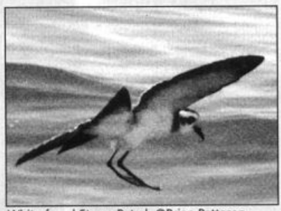
White-faced Storm-Petrel

http://www.netlink.co.uk/users/aw/abchome.html