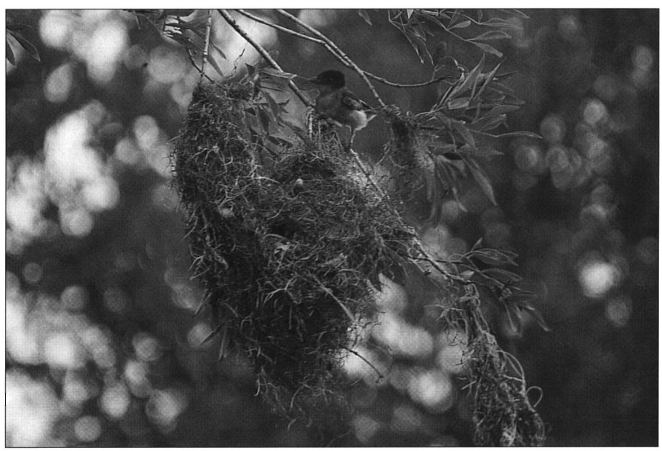
A bulky and conspicuous Rose-throated Becard nest, under construction on 26 June in Anzalduas Park, Hidalgo County, is typical of the species. Some have been recorded as long as 30 inches; the entrance will be at or near the bottom. This first nesting in Texas in more than twenty years was unfortunately not successful.

at Rio Grande Village and Cottonwood Campground (MF, m.ob.); however, evi-