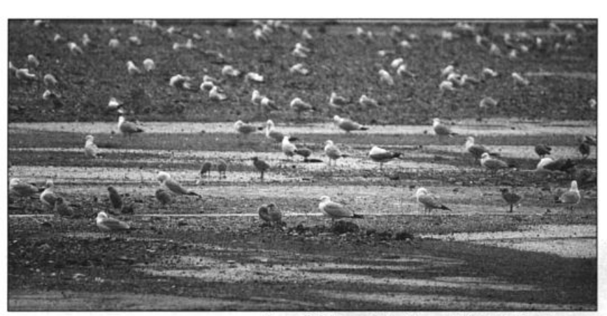
The juveniles interspersed among adults on 17 June at the General Electric Plant on the east side of the city of Erie document the first successful colonial nesting of Ring-billed Gull in Pennsylvania.

Three gull chicks delivered to Erie bird rehabilitator Wendy Campbell led to the discovery of the first successful nesting colony of Ring-billed Gulls in Pennsylvania. An estimated 700-800 adults, including many incubating birds, and at least 120 chicks were subsequently located in mid-June near the General Electric plant in e. Erie (LM, JM). The fact that so large a colony had gone undetected, presumably for several years, was no doubt due in part to birders having focused their attention on the favored destination of Presque Isle on the opposite side of Erie. Several previous Ring-billed nesting attempts at P.I.S.P. had all been unsuccessful.