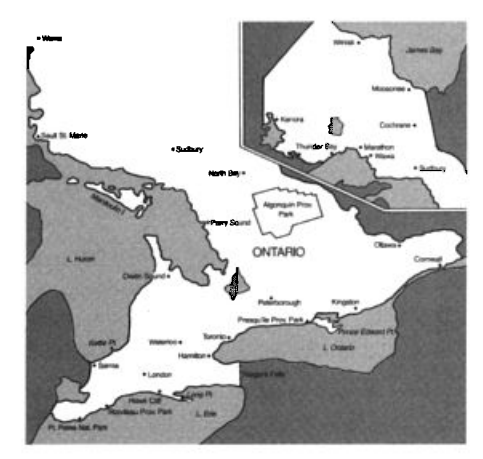
The following report covers the December 1998–February 1999 winter season, followed by the June–July 1999 summer season.