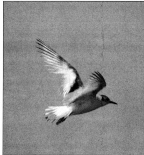
A first-summer Little Gull at the south end of the Salton Sea, 23 May 1999, with extremely worn wing and tail feathers (which are retained from juvenal plumage and thus nearly a year old).