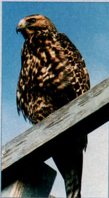
Swainson's Hawks were especially numerous in the East this year. This juvenile of one of the darker morphs was on Great Gull Island September 18, a first Long Island, New York, record. The subterminal tailband is scarcely wider than other tailbands, a good clue for ageing this young perched bird.