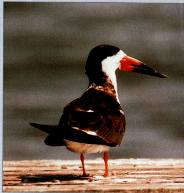
Illinois's first Black Skimmer frequented the beach at Decatur, where it was most satisfactorily photographed on September 4.

record. Good field characters that together suggest Parasitic are the rufous edging of the upperwing coverts, the haphazard checkered pattern in the uppertail coverts, the pale, streaked nape, and the pale tips of the primaries. The tips of the central rectrices are a bit worn but still do not show the long, rounded shape one sees in juvenile Long-tailed.