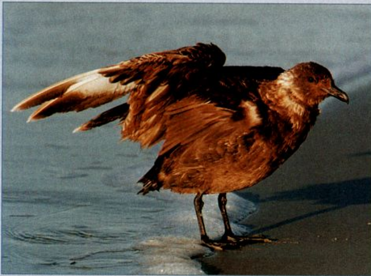
South Polar Skua at South Beach, Jekyll Island, Georgia. October 18. Another two South Polars graced beaches at Smyrna Dunes Park and Fort Clinch, Florida, not far away. This bird shows a bright golden nuchal area typical of the species, a lack of ruddy coloration in the plumage, and a petite-looking head and bill.