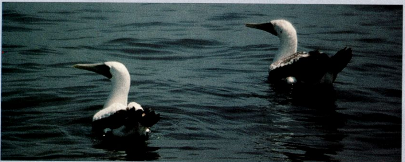
Masked Boobies are regular in the northern Gulf of Mexico over deep water during the warmer months, sometimes seen daily by whale researchers in the area. Rarely are they documented so nicely as this pair, an adult and a subadult about 72 km southeast of Louisiana's South Pass.