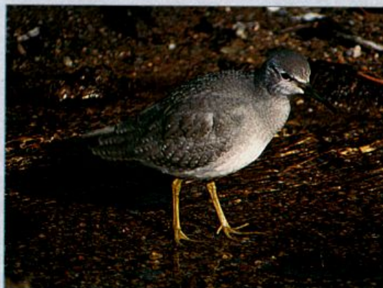
This Gray-tailed Tattler, one of eight present on Gambell, Saint Lawrence Island, Alaska, between August 25 and September 9, can be distinguished from the similar Wandering Tattler at this age by the extensively pale belly and large amount of white spotting in the scapulars and tertials. ("And, yes, we heard it call as well," the photographer assures.)