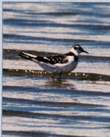
Little Gull, a striking juvenile photographed at Prewitt Reservoir, Washington County, Colorado, in mid-September, was one of two in the state this season. A Little Gull in New Mexico showed up just after this bird's departure.