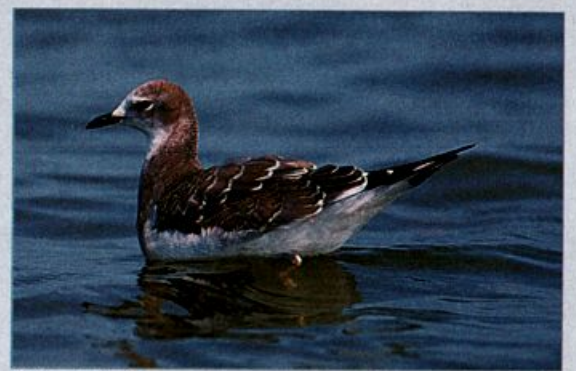
Sabine's Gulls once again stole the show this fall: record counts in Monterey Bay, a slew of Texas records, some the result of Hurricane Frances, and a healthy scattering across the coasts and interior from an alphabet soup of sites: AR, NC, LA, MI, MS, WI, NB, ND, VT, MA, with great numbers in CO (40), NM (18-25), NE (32), AZ (13), and Bermuda (13)! This lovely photograph was taken at Millwood Lake, Little River County, Arkansas.