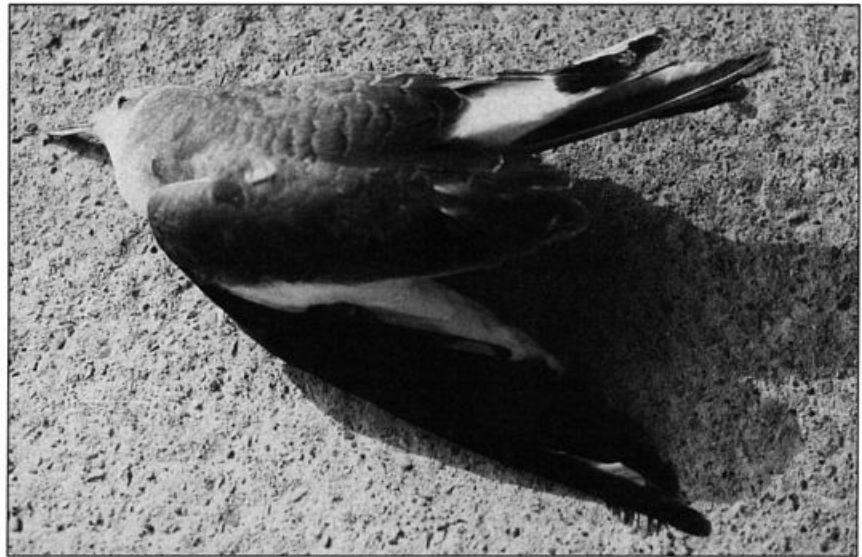
This juvenile Sabine's Gull was found dead at Presqu'ile State Park, Pennsylvania, September 24.

The only reports of Willet came from L. Oneida, Butler , PA, Aug. 10 (DY) and u. D. L. Sep. 6 (FA). Up to 6 Hudsonian Godwits were found at Mosquito L. Oct. 21-Nov. 8 (m. ob.), and one was at P.I.S.P. Sep. 2-4 (DS, JM). A Marbled Godwit was at u. D. L. Aug. 20 (DE). Red Knots were at P.I.S.P. Aug. 27 (DS) and at Woodcock L. Aug. 20 (RFL). Up to 20 Buff-breasted Sandpipers were at u. D. L. Aug. 20-31 (DE), and they were reported from Shenango L. as well ( fide PH). The rarely reported Long-billed Dowitcher was found at Eaton Res., Erie , PA, Aug. 16 (GR), Pymatuning L., Aug. 16 & 30 (RFL), Wood, WV, Sep. 3-4 (JE), and Russell , VA, Oct. 13 (RR). Wilson's Phalaropes were at Conneaut Marsh, PA, Aug. 16 (RFL), Lyndhurst, VA, Aug. 26 (YL), and a