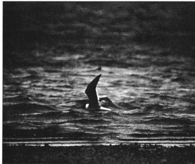
Definite Laughing Gull records are less than annual in New Mexico, so the occurrence of three this spring was a major surprise. This adult was at Brantley Lake, Eddy County, May 14, 1998.

Surveys for Lesser Prairie-Chickens in the northeast found none, but numbers were up slightly in the Milnesand and Caprock areas (v.o.). Noteworthy was a vocal Virginia Rail in the Animas Valley May 10 (AC). Single Com. Moorhens wandered N to Santa Rosa May 16 (JEP, ph. JO) and Portales May 2 (ph. JO) & 9 (JEP, JO).