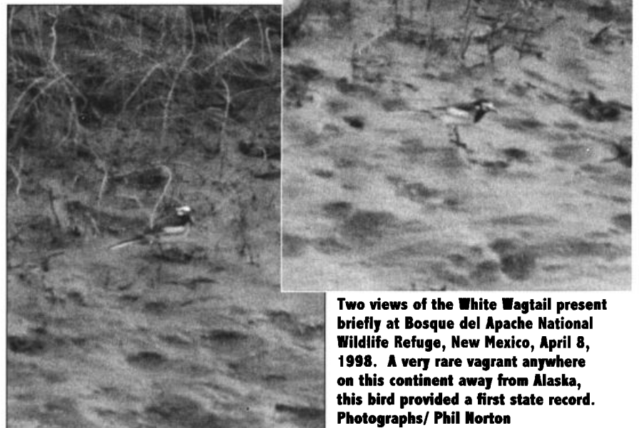
Two views of the White Wagtail present briefly at Bosque del Apache National Wildlife Refuge, New Mexico, April 8, 1998. A very rare vagrant anywhere on this continent away from Alaska, this bird provided a first state record.

Three vocal Golden-crowned Kinglets were at Capilla Peak May 23 (WH). Black-