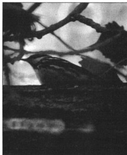
New Mexico recorded four Blackpoll Warblers during early May this season, including this male at Rattlesnake Springs, Eddy County, May 10, 1998.