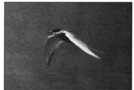
Providing only a fourth record for New Mexico was this Arctic Tern at Brantley Lake, Eddy County, May 15, 1998.