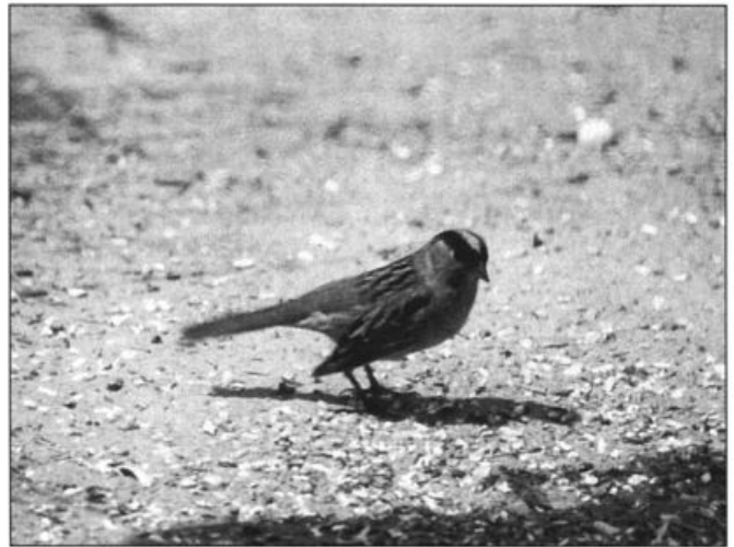
In Mesa County, western Colorado, this adult Golden-crowned Sparrow put in an appearance in late April 1998.

May 2–3 (DSi, DJ, m.ob.); Lathrop S.P., Huerfano , May 8 (JJR, LR); Two Buttes Res., Baca , May 17 (JP); Prewitt Res., Washington , May 19 (DAL); and Lamar May 20 (DSi, BKP, BD). A singing male Golden-winged Warbler was at Fontenelle Dam, Lincoln , WY, May 30 (C&BB, RSb). Also, single Golden-winged Warblers in Colorado were at L. Henry, Crowley , May 11 (BKP, m.ob.); near Capulin, Conejoes , May 16, the first S.L.V. record (JJR); and at Tamarack Ranch S.W.A., Logan , May 19 (DSi). A Tennessee Warbler n. of Tonopah, NV, May 31 (GC et al.) was unusual. Rare in Wyoming, a Magnolia Warbler was at Fontenelle Dam May 24 (RD, JLD). A Cape May Warbler hit a window in Las Vegas May 14 (JC), providing one of few records for Nevada. Another Cape May stopped at Two Buttes Res., CO, May 10 (JP). A male Black-throated Blue Warbler found its way to Montezuma , CO, May 28 (CLW). This species is very rare in s.w. Colorado.