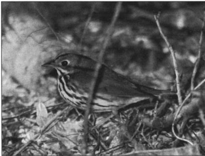
At the famous vagrant trap of Corn Creek, near Las Vegas, Nevada, this Ovenbird was a good find May 24, 1998.