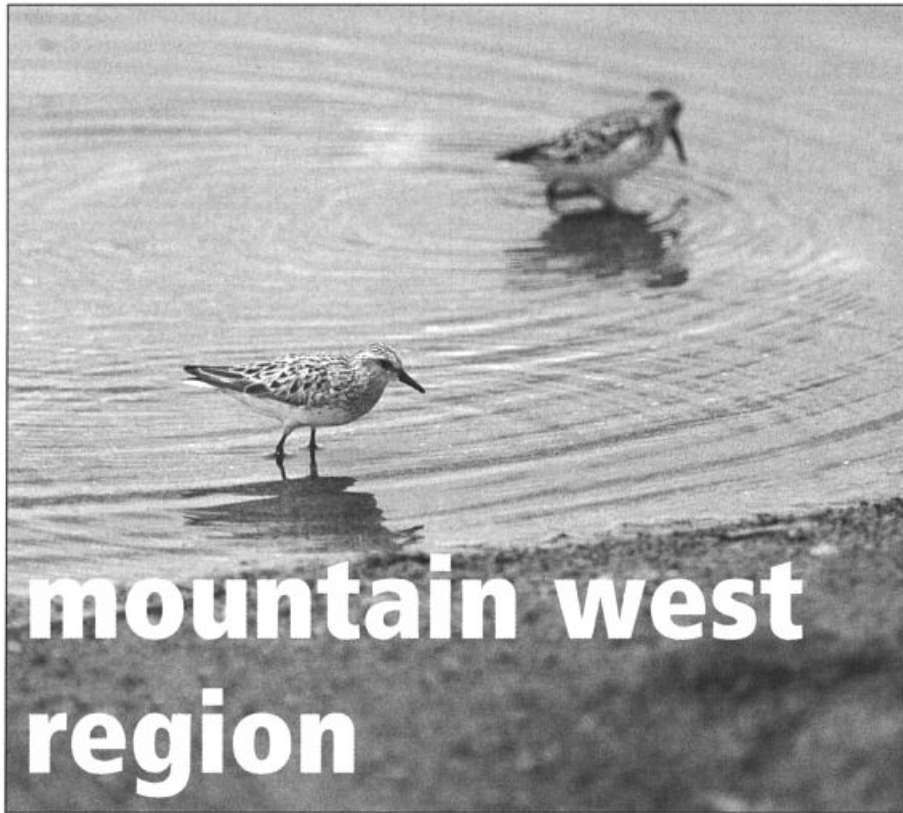
The status of Semipalmated Sandpiper as a migrant in Nevada is still poorly known. This bird was at Big Soda Lake, near Fallon, Nevada, May 7, 1998.

Mar. 13–16 (BHu, m.ob.) and a Tufted Duck × scaup e. of Timnath, Larimer , Mar. 15 (JM). The real question is, are the Tufteds domestic and breeding with wild scaup, or are both species wild birds? Rare in S.L.V., a male Surf Scoter was at Monte Vista, Rio Grande , May 7–11 (JJR, LR), and a male White-winged Scoter was at Antelope I. Marina, Davis , UT, Apr. 26 ( fide MS).