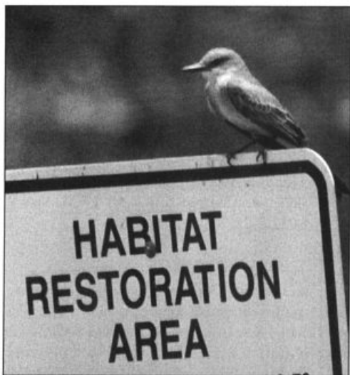
Tropical Kingbird at Fort DeSoto County Park, Florida, May 12, 1998. Following several plausible past sightings, this may be the first fully confirmed record for the state.