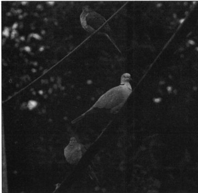
Eurasian Collared-Dove (with Mourning Doves) in Morro Bay, California, on December 4, 1997. This species appears to be established at a some localities along the coast of southern California, but the origin of these populations is unknown.