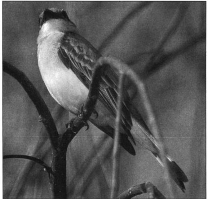
Couch's Kingbird in Fullerton, California, on January 11, 1998. A first record for the Pacific Coast, this bird was understandably first identified as a Tropical Kingbird. Although vocalizations are the best way to distinguish the two, notice this bird's very broad-based bill, seen to good advantage in this picture. For another photo, see the pages of Pictorial Highlights.

24–Feb. 14 (TRC) is one of a few known to have spent the winter in S. California. Three Vaux's Swifts near Cambria Jan. 19 (BAB) and one with White-throated Swifts over L. Hodges, San Diego , Dec. 14 (BKS) were undoubtedly wintering locally. A female Broad-billed Hummingbird in Rancho Santa Fe, San Diego , Jan. 5–10 (MBS) was the only one found this winter. Totally unexpected was a male Broad-tailed Hummingbird in Santa Barbara Jan. 3 on (RAH), since this species is accidental along the coast and recorded only once before in California in winter. Six Yellow-bellied Sapsuckers were reported, with single birds along the coast at El Capitan State Beach near Goleta Nov. 26–Jan. 15 (JEL), in Goleta Mar. 1 (KB), at Saticoy Dec. 21–Feb. 15 (ST), Orange Jan. 18–25 (DRW), in San Diego Mar. 3 (DA), and inland at California City, Kern , Jan. 10 (JCW).