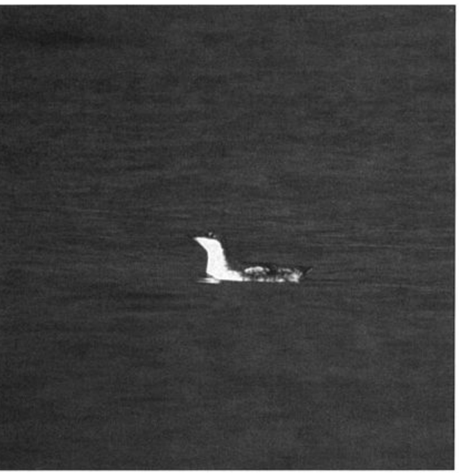
A wanderer from Asia, this Long-billed Murrelet was south of Muir Beach, Marin County, California, on December 27, 1997. Although Long-billeds (only recently split from Marbled Murrelet) have strayed to various parts of North America—even as far south as Florida — this individual was the southernmost yet on our Pacific Coast.