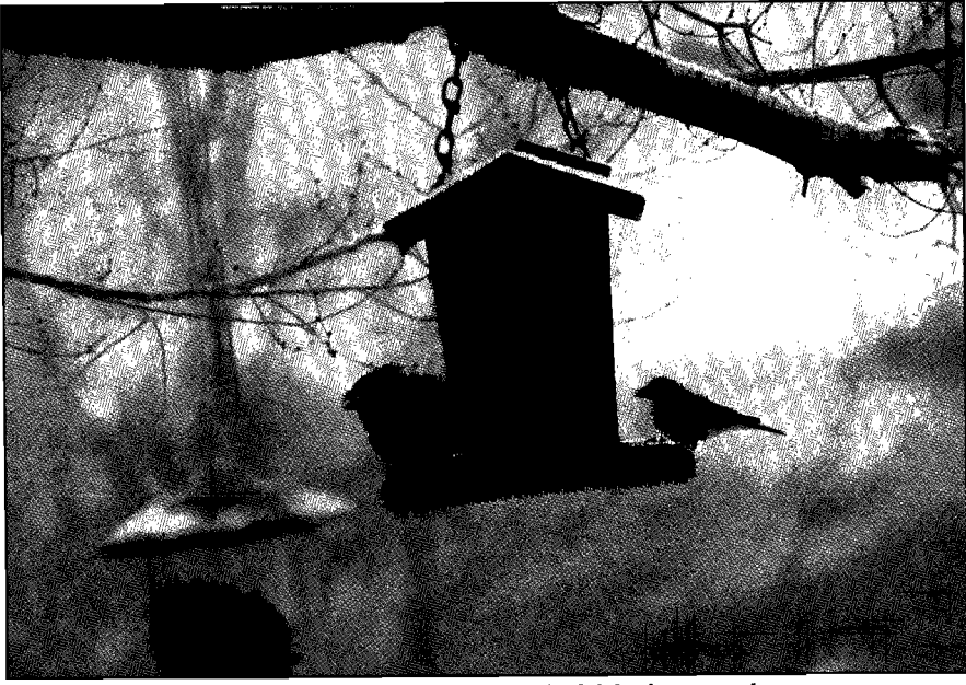
West of its usual range was this male Northern Cardinal (sharing a meal with an American Goldfinch) at Rockvale, Colorado, in January 1998.