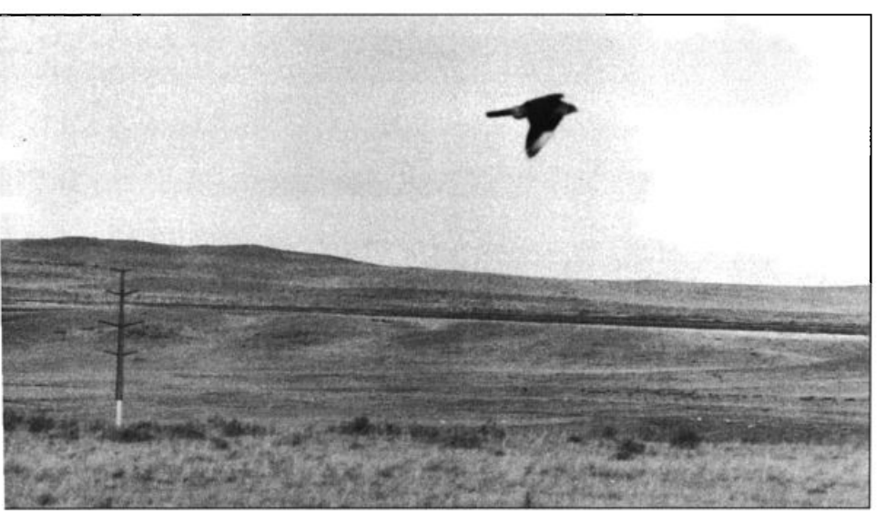
Rare so far south was this immature gray-morph Gyrfalcon at Hamilton Reservoir, Colorado, on January 19, 1998.