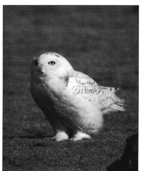
Snowy Owl north of Lamar, Colorado, on February 26, 1998.