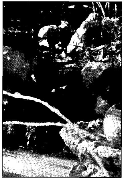
Fox Sparrows are rare in winter in Colorado. This bird, of one of the more reddish eastern or northern races, was at Red Rocks Park west of Denver on January 2, 1998.

SA The higher temperatures this season allowed water in lakes and streams to remain elevated longer. thus yielding more days of emergent chironomids (midges) and other aquatic insects. Along the Arkansas R. below Pueblo Res., up to 50 warblers fed on midges daily until several days of cold, "cloudy" weather appeared. The cloudy days seem to eliminate or reduced the emergents and may have forced the warblers to move to other areas, or may have caused weak birds to perish. On sunny days, these midge "hatches" can and do occur, even where temperatures are well below freezing. The Pine Warbler at Valco Ponds was observed feeding on both larval and adult midges. It probed in muddy areas and flycatched in willows and Russian olive trees adjacent to the river. With the onset of "cloudy" weather, the warbler disappeared, along with most of the Yellow-rumped and the Palms. Luckily for s. Colorado, we have numerous sunny days, and "hatches" of midges occur almost daily in winter since water from Pueblo Res. comes from sub-surface lake discharges.