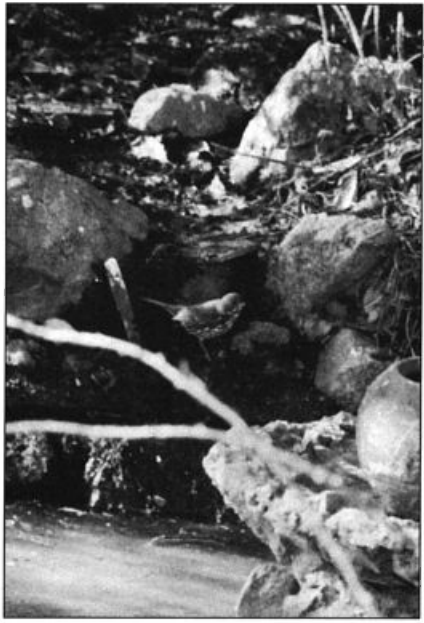
Fox Sparrows are rare in winter in Colorado. This bird, of one of the more reddish eastern or northern races, was at Red Rocks Park west of Denver on January 2, 1998.

The higher temperatures this SA season allowed water in lakes and streams to remain elevated longer, thus yielding more days of emergent chironomids (midges) and other aquatic insects. Along the Arkansas R. below Pueblo Res., up to 50 warblers fed on midges daily until several days of cold, "cloudy" weather appeared. The cloudy days seem to eliminate or reduced the emergents and may have forced the warblers to move to other areas, or may have caused weak birds to perish. On sunny days, these midge "hatches" can and do occur, even where temperatures are well below freezing. The Pine Warbler at Valco Ponds was observed feeding on both larval and adult midges. It probed in muddy areas and flycatched in willows and Russian olive trees adjacent to the river. With the onset of "cloudy" weather, the warbler disappeared, along with most of the Yellow-rumped and the Palms. Luckily for s. Colorado, we have numerous sunny days, and "hatches" of midges occur almost daily in winter since water from Pueblo Res. comes from sub-surface lake discharges.