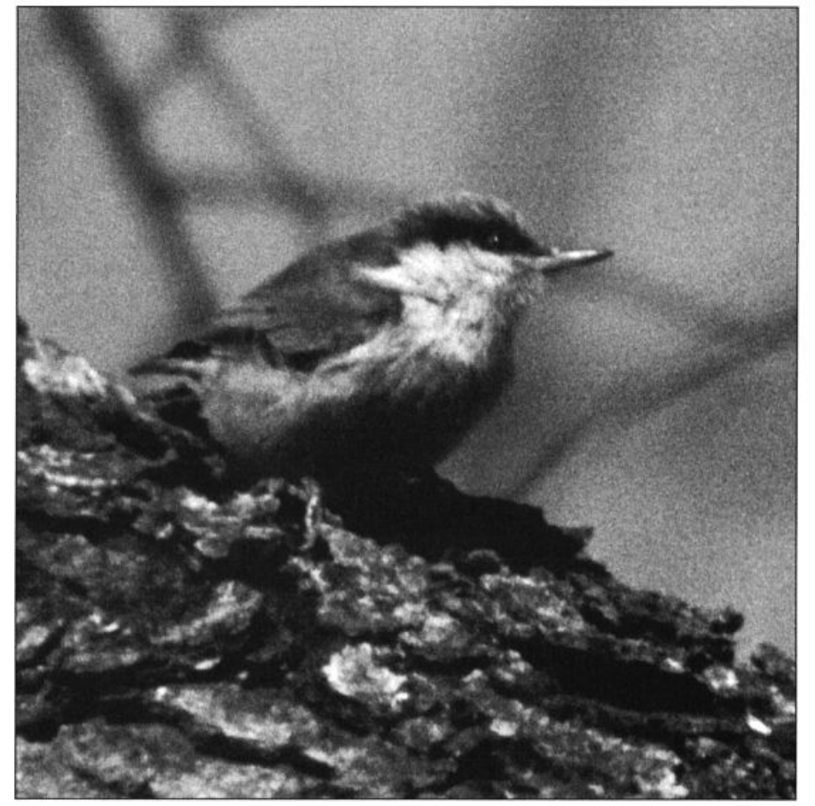
A Christmas gift for Kansas birders, this Brown-headed Nuthatch—a first state record—showed up in Mission Hills on December 25, 1997, and stayed for a month.

A Black-billed Magpie wandered E to Sedgwick, KS, Dec. 4 (TH). A Brown headed Nuthatch documented in Johnson, KS, Dec. 25–Jan. 25 (MM, m.ob.) was the