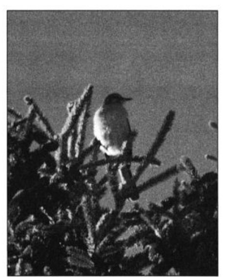
Two views (taken on December 28, 1997) of the Northern Mockingbird that attempted to live up to its name by wintering in Calgary, Alberta, the third such record there.