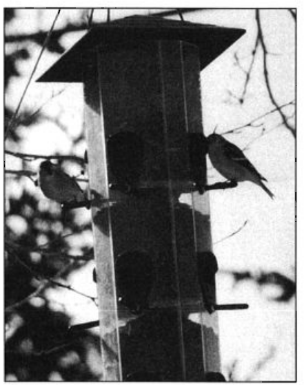
Reflecting the mild season (and some human help) were these American Goldfinches as far north as High River, Alberta, on February 28, 1998.

and California Gulls at Grand Centre and Cold L. (three birds) Dec. 11 (SB). Glaucous Gulls were found in all 3 provinces in early December, and an unidentified gull was in Calgary Feb. 3 (LS).