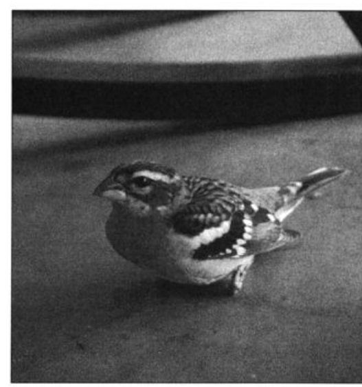
Relaxing on the porch in Lafayette Parish, Louisiana, on January 29, 1998, this immature male Black-headed Grosbeak was rare for winter and unusually far east.