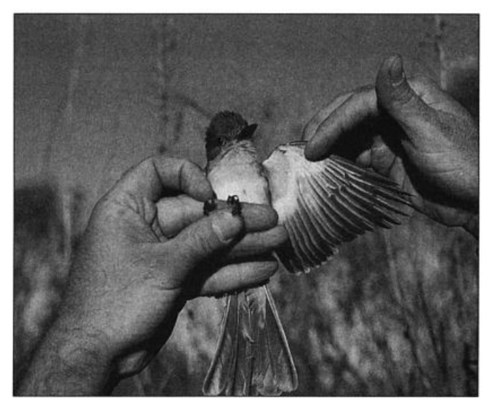
Two views of a Brown-crested Flycatcher at Delta National Wildlife Refuge, Louisiana, on February 24, 1998. It was identified as representing the race cooperi (normally found as close as southern Texas and eastern Mexico), not quite as large nor as large-billed as the race magister from the southwestern United States and western Mexico. Note the pattern of darkness on the outer tail feathers as seen from below.

LA, in late February (PY, RK, TK). Less rare but still notable was a Com. Ground-Dove in Tunica , MS, Jan. 11 & 17 (JRW). Sixteen Rose-ringed Parakeets in Orleans , LA, during midwinter (BRu) provided modestly interesting news, but 128+ Monk Parakeets counted in Orleans/Jefferson , LA (BRu, m.ob.), during just one day—Jan. 24—including 9 sightings of nest building, may be cause for modest alarm, at least by those with exoticaphobia.