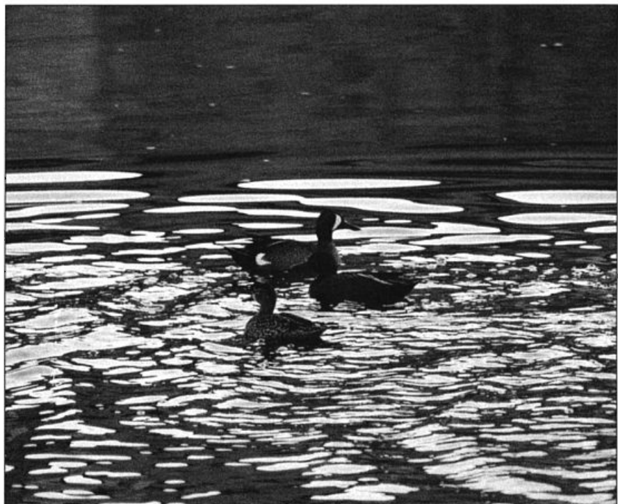
Farther east than usual was this male Cinnamon Teal (center, with Bluewinged Teal) in New Orleans, Louisiana, on February 8, 1998.