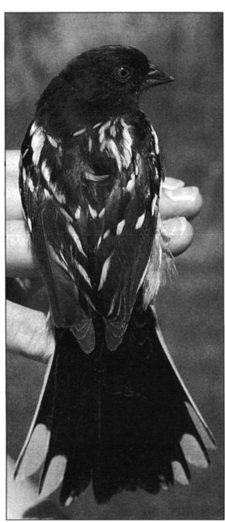
Notably far east was this Spotted Towhee at Baton Rouge, Louisiana, on February 23, 1998.