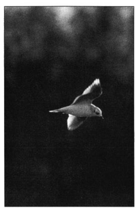
Astoundingly, lowa had visits by two adult Ross's Gulls this season. This one was at Red Rock Reservoir in the central part of the state on December 13, 1997.