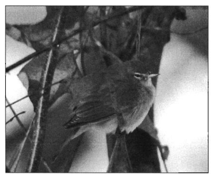
Orange-crowned Warblers often manage to hang on through the winter farther north than most of their relatives. No fewer than five wintered in Illinois this year, including this bird in Will County on December 30, 1997.