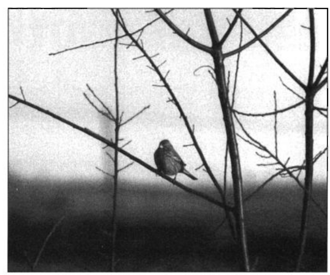
Very rare for the upper Midwest was this Lark Bunting, present for several weeks and photographed on February 1, 1998, in eastern Holmes County, Ohio.