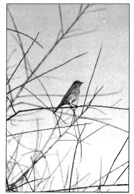
A second for Indiana was this Mountain Bluebird at Lake Monroe on January 31, 1998.

peratures the normal "dead of winter" gull build-up did not occur; however, gull diversity, highlighted by two Ross's Gulls in Iowa, remained high. In addition, a fine contingent of western species graced the Region, with the likes of two Say's Phoebes, a Mountain Bluebird, a Varied Thrush invasion, and a Lark Bunting. Finally, a February road-kill Sooty or Bridled Tern in Indianapolis served to keep the El Niño mystique alive.