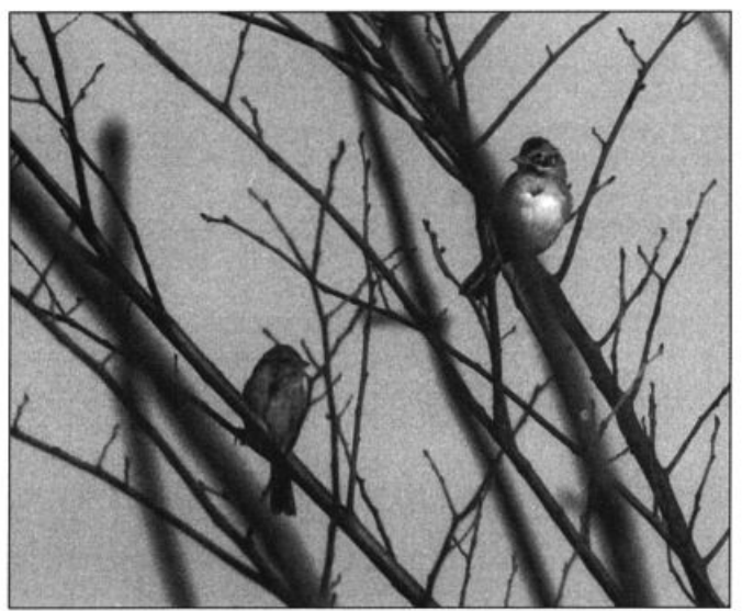
Lark Sparrow (foreground, with an American Tree Sparrow) in eastern Holmes County, Ohio, on February 1, 1998.