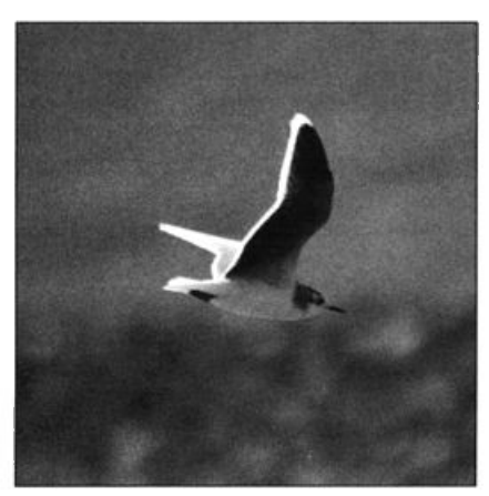
The West Point Lake Dam in Troup County, Georgia, hosted the state's second documented Little Gull on February 9, 1998. There are few inland records of the species anywhere in the Southeast.