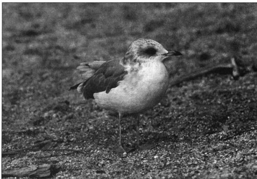
The first Mew Gull known to have spent the summer in Idaho, this bird was still present at Sandpoint on August 28, 1997.

Monitoring activities at Boise Ridge hawk watch near Boise, ID, were expanded this fall to include mist-netting migrating passerines. Among the surprises were the state's 15th Tennessee Warbler Sept. 1 (ph.