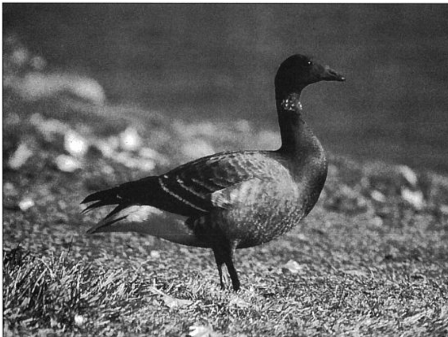
This Brant in Boise, Idaho, on November 16, 1997, provided an eighth state record. The diffuse white neck patch and the strong pale bands on the wings indicate an immature.