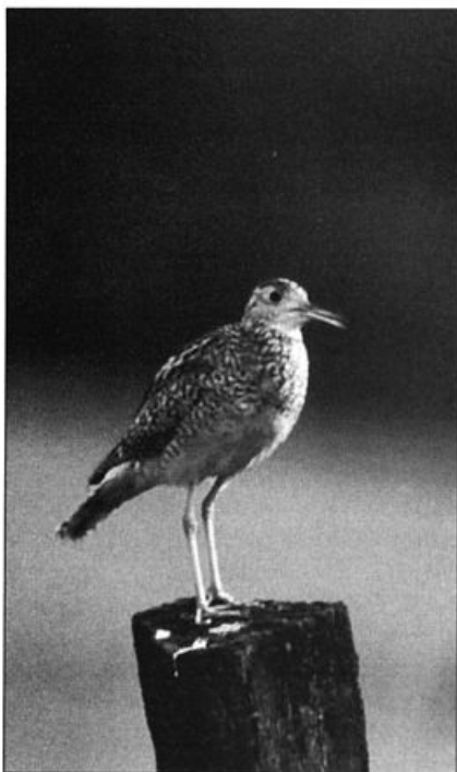
Idaho's only known current population of Upland Sandpipers, discussed in the previous issue of Field Notes , is in Valley County, where this bird was photographed on June 16, 1997.

most fall seasons. As usual, a handful of Surf and White-winged Scoters were scattered across Idaho in October and November. Montana had seven Surf and seven White-wingeds at the Frenchtown mill ponds Oct. 13 (DH), and six White-wingeds at Brown's L., Powell, Nov. 5 (JM). Idaho's 3rd Black Scoter , an imm. female, was below A.F.R. Nov. 29–30 (TG, †DNS, CT, m.ob.), in the same spot where a female was observed Nov. 4, 1996.