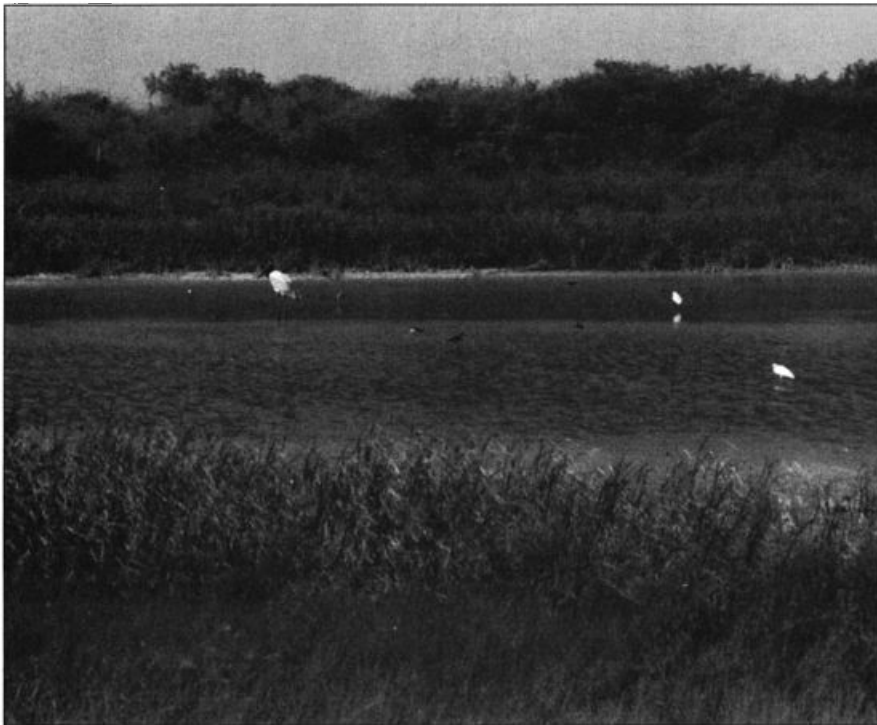
Good thing it's a big bird: seen at a great distance, but still photographed for confirmation, this Jabiru was seen at Laguna Atascosa National Wildlife Refuge, Texas, only on August 11, 1997. This huge tropical stork had been found in the United States only half a dozen times previously, with the last record in 1985.

Ten ad. White-tailed Hawks on Mustang I. Nov. 20 (CC) were a new high tally for