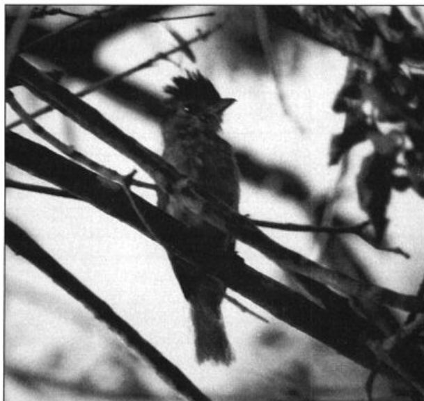
The Rose-throated Becard flirts with the Texas border, appearing north of it only occasionally. This bird remained at Santa Ana National Wildlife Refuge from late July to early October, and was photographed on August 18, 1997.

A Least Flycatcher at Ft. Bliss Sept. 10 (BZ) provided a rare El Paso area record. A "Western" flycatcher, thought to be a Cordilleran, was at College Station Sept. 27 (†BeF, SD), while another was reported Honey Creek S.N.A. on the same date (SWie). A Myiarchus believed to be an Ash-throated was in Harrison Sept. 4 (DMet, PHa), an unusual record for n.e. Texas. Wandering Great Kiskadees included individuals at Indianola Sept. 23 (PH) and near Bandera Oct. 4 (SWie). An out-of-range Couch's Kingbird was reported at Brazos Bend Nov. 30 (TxB). A somewhat out-of-place Cassin's Kingbird was at Midland Oct. 4 (SS, DK). Noteworthy Eastern Kingbird concentrations included 70 in Hemphill Aug. 23 (EK et al.) and "several hundred" in stormy weather at Indianola Sept. 23 (PH). A Fork-tailed Flycatcher near Anahuac, Chambers, Sept. 13 (†DS) will provide the 10th Texas record, if ac-