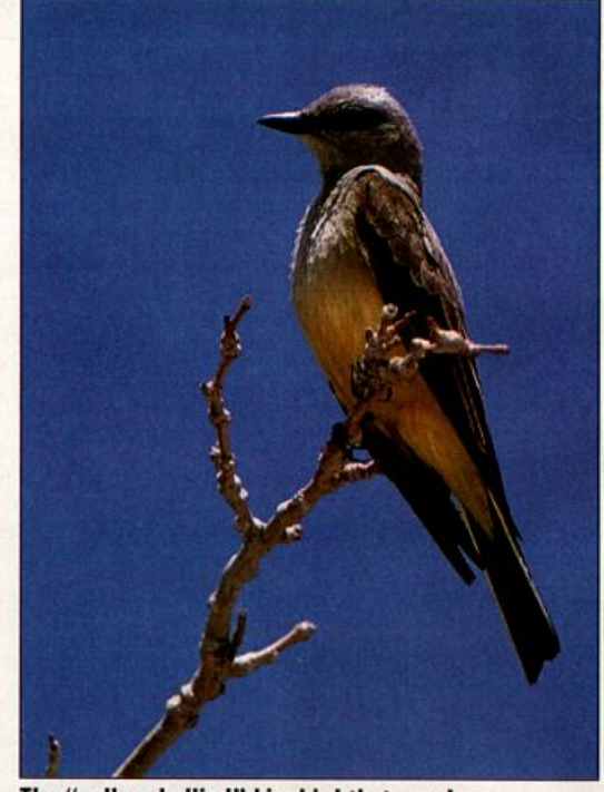
The "yellow-bellied" kingbird that wanders most widely in North America is the Western, and some out-of-range Tropicals may have been passed off as that species. As seen here, the white outer edges of the outer tail feathers on Western Kingbird can be very narrow (or practically absent when the bird is in very worn plumage). However, the tail is still black, not dusky brown, and Western Kingbird also has a smaller bill and much more extensive pale gray on the chest than Tropical Kingbird.