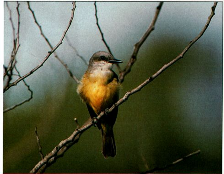
At first glance, a stray Tropical Kingbird might be mistaken for the much more numerous Western Kingbird (see below). A second look would reveal that the tail is dusky brown, and notched at the tip. The yellow of the underparts extends well up onto the chest, and grades into olive there, whereas the Western Kingbird has the chest mostly pale gray. The larger bill of the Tropical may also draw attention.