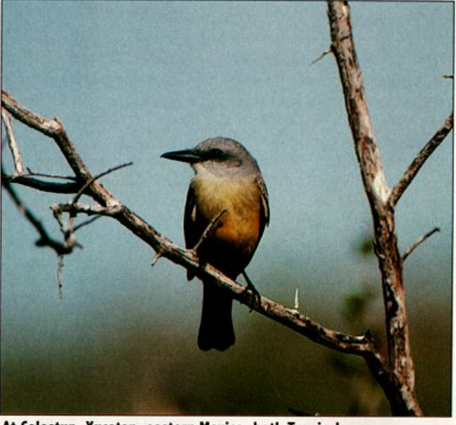
At Celestun, Yucatan, eastern Mexico, both Tropical and Couch's kingbirds are possible, so this Tropical was identified carefully by voice. Even without that confirmation, we might guess that it was a Tropical because this individual looks so long-billed; there is much overlap, but some Tropicals are longer-billed than any Couch's Kingbird.