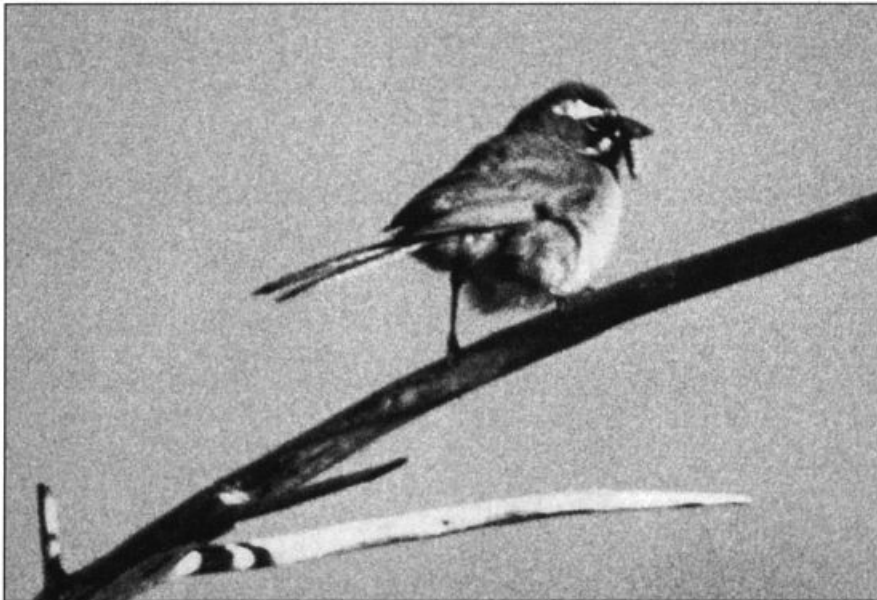
In a recent burn at 5000 feet in El Dorado County, California, this adult Black-throated Sparrow was carrying food to a fledgling on July 12, 1997. This represents one of the very few breeding confirmations on the west slope of the Sierra Nevada.