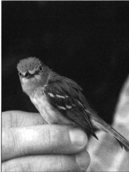
At the Turkey Creek MAPS station in El Paso County, central Colorado, this White-eyed Vireo was captured for banding on June 17, 1997.