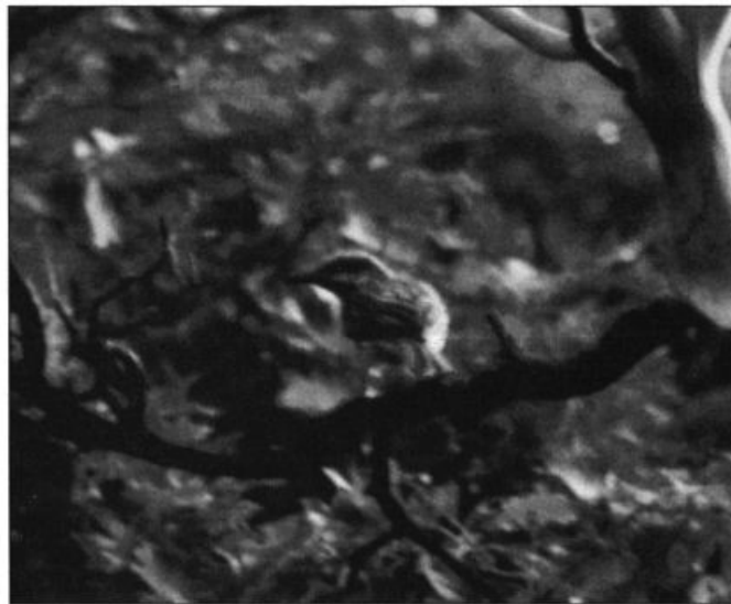
In Pine Canyon, Big Bend National Park, this Sulphur-bellied Flycatcher furnished an overdue first record for the park on July 28, 1997.

Late Olive-sided Flycatchers included singles at Santa Ana June 5 (TB) and at Hagerman June 10 (WM). Single W. Wood-Pewees at Oldham July 25 and Buffalo L. July 28 (KS) were considered early migrants. Of interest was a singing Alder Flycatcher at Santa Ana June 3 (TB); this species is known to be a late migrant, but there are few June records in Texas. Rare for summer were single Black Phoebes at Falcon Dam