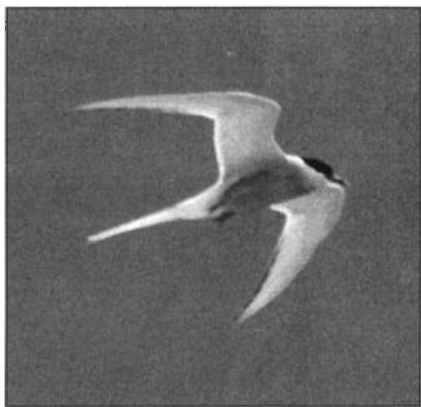
In early June 1997 in far western Texas, this adult Arctic Tern furnished the (long-awaited) first fully confirmed record for the state.