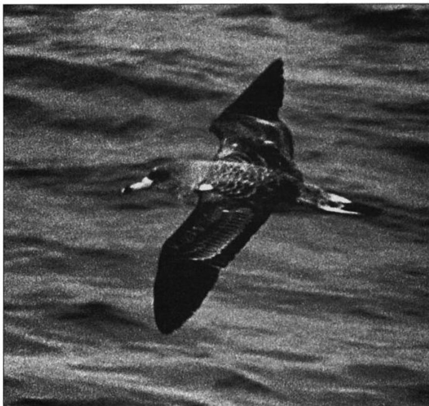
One of the two Cory's Shearwaters found on the pelagic trip off Port O'Connor, Texas, on June 28, 1997.