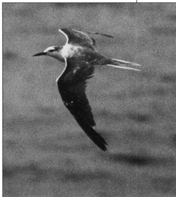
Formerly considered a rare summer visitor off the Texas coast, Bridled Tern is now proving to be regular at that season. The June 28, 1997, pelagic trip out of Port O'Connor turned up a remarkable 200 or more. This individual is in heavy molt, partway through replacing the flight feathers.

In the Panhandle, Least Tern is normally confined to the e. tier of counties; this summer one was in Donley July 7 (KS). Least Terns nested at S.S.W.T.P. in June and July (EW, RR), but none of the many chicks fledged. Least terns were also seen at Hagerman and Cooper L. during the season (LL, MWh). More than 200 Bridled Terns were seen on the June 28 pelagic, and many more could have been counted had the boat followed more of the sargassum lines (fide BF). At least 12 Sooties were seen on the June trip, but the abundances were reversed on the July 26 pelagic when 230 Sooties and only three Bridleds were tallied (m.ob.). A single Black Tern in McAllen June 18 (TB) was unseasonal slightly inland from the coast; numbers of Blacks seemed exceptionally high at coastal locations in late June.