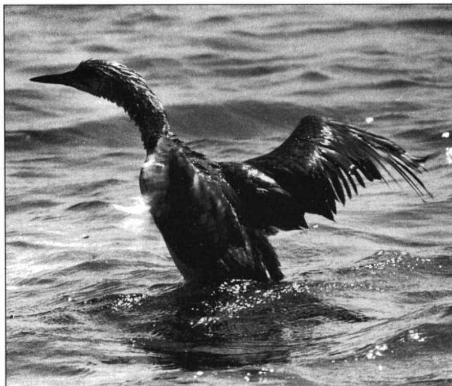
Pacific Loon at Galveston, Texas, on June 20, 1997. Probably a subadult bird, as judged by the condition of its plumage at this season, this individual furnished a rare summer record for Texas.