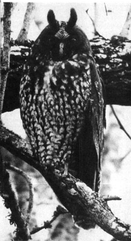
Considered by many to be the most extraordinary bird of many a year, this Stygian Owl—a little-known bird of the American tropics—was seen for one day only at Bentsen State Park, Texas, December 26, 1996. Far from known localities in Mexico, it furnished a first record for the United States.