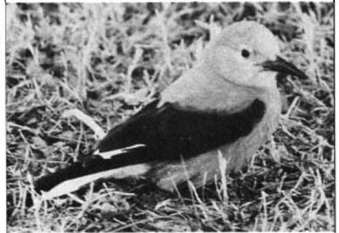
At least five Clark's Nutcrackers reached Texas this winter. This one was in Irion County February 1, 1997.