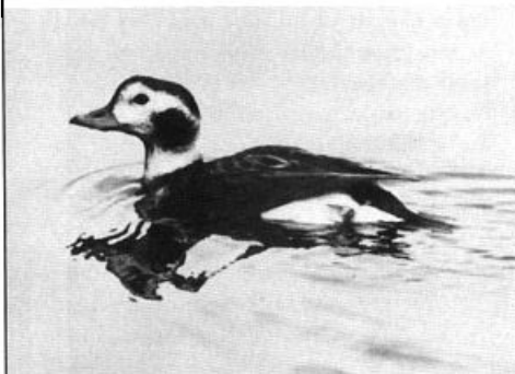
Oldsquaw in Tyrrell Park, Beaumont, Texas, December 14, 1996.