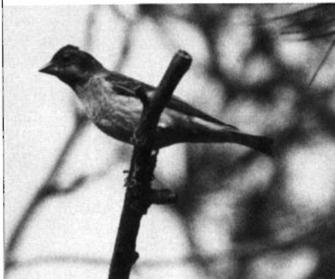
Among the western montane birds that invaded the lowlands, Cassin's Finch played a prominent role. This male was near Kenton, Oklahoma, December 7, 1996.