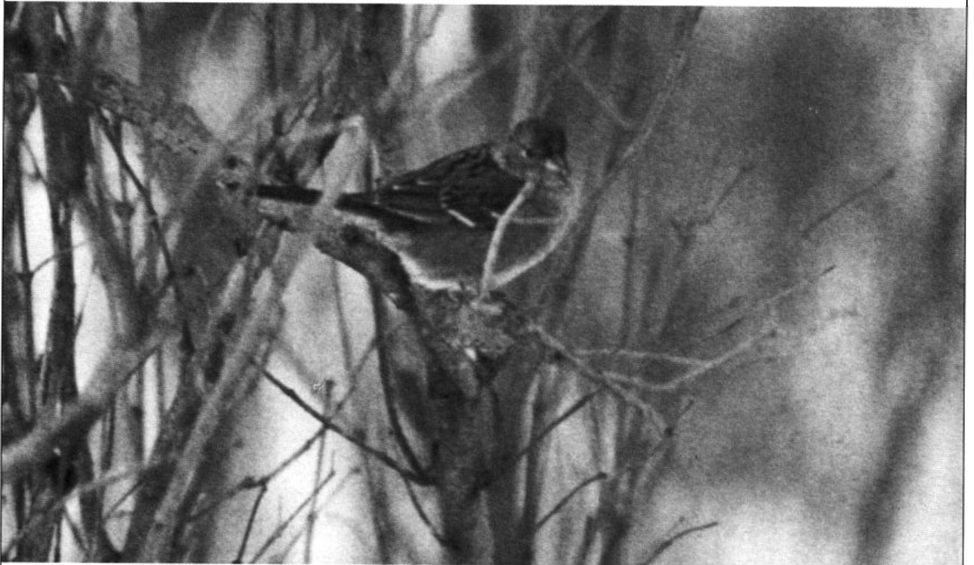
Present since fall, this Golden-crowned Sparrow at J. Clark Salyer National Wildlife Refuge December 7, 1996, represented the fourth record for North Dakota.

Twenty were at a feeder in Malta Jan. 19, and six were at Bowdoin Jan. 26 (DP, LH). In Miles City, 26 were noted Dec. 21.