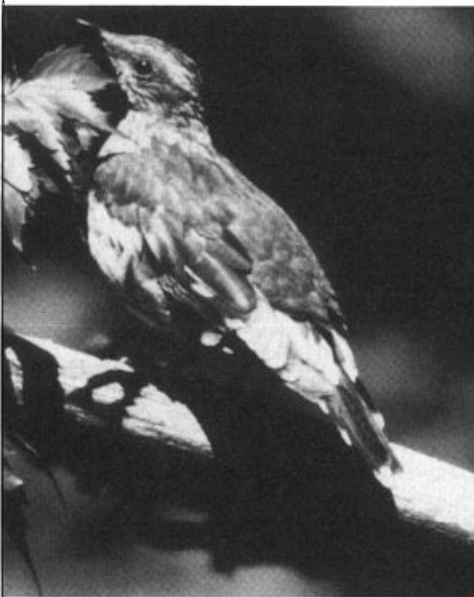
A remarkable invasion brought as many as twenty-one Aztec Thrushes to southern Arizona during the season. This was one of the birds in Miller Canyon, Huachuca Mountains, in early September.