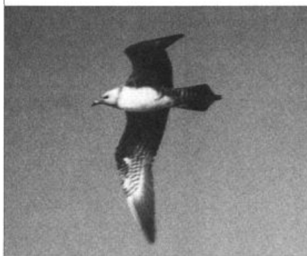
Long-tailed Jaeger at Bitter Lake National Wildlife Refuge, New Mexico, September 6, 1996. This individual was a good example of the pale-headed, white-bellied appearance shown by the palest juveniles of this species.

Encouraging was a pair of White-tailed Ptarmigan with four chicks near Jicarita Peak Aug. 3 (ph. JO); four additional adults were also seen nearby (JEP, JO). An impressive 28 Montezuma Quail were in Indian Cr. Canyon, Animas Mts., Oct. 5–13 (TH). Considered late were one—two Virginia Rails in San Juan Nov. 27 (TR), as were nine at Zuni Nov. 9 (DC). Well-detailed was an American Golden-Plover at B.L.N.W.R., Sept. 27 (JEP, JO); the only Black-bellieds were one—three at La Joya Aug. 11 (WH, JO) and one at B.L.N.W.R., Sept. 6 (JEP, JO). Migrant Mt. Plovers included 150 in 3 flocks at Farley Sept. 4 (GS) and nine near Roy Sept. 5 (GS); other migrants passed through the turf farms at Moriarty Aug. 12–Sept. 20 and Los Lunas Aug. 10–Sept. 20, where there were single day maxima of 78 and 48, respectively (v.o.). The Upland Sandpiper migration was judged as poor in the southeast (SW), where high counts amounted to but six—seven at B.L.N.W.R.,