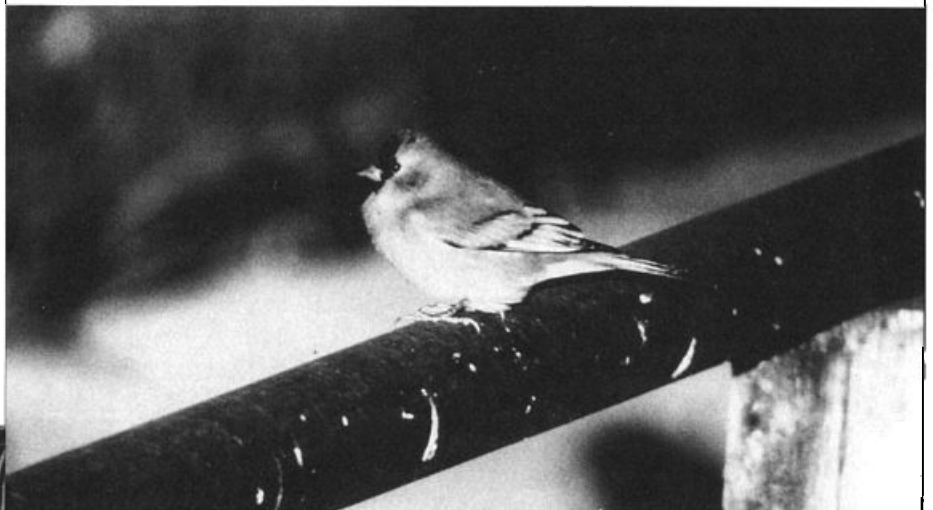
A notable invasion of Lawrence's Goldfinches reached New Mexico this season. The northernmost, only a few miles from the Colorado border, was this male at Bloomfield, San Juan County, October 17, 1996.