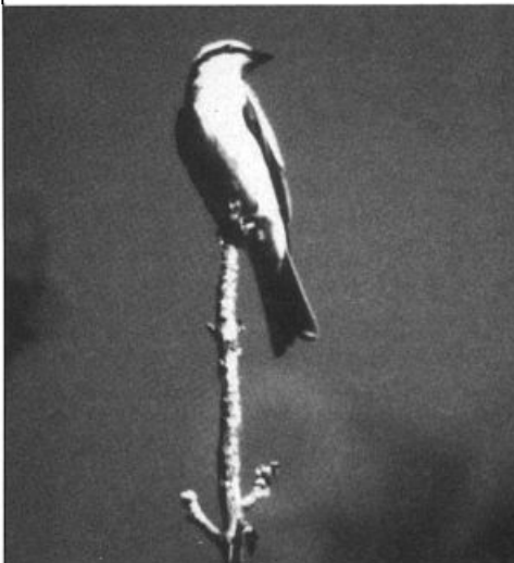
Apparent Piratic Flycatcher at Rattlesnake Springs, Eddy County, New Mexico, September 7, 1996. This tropical species had not been identified in North America before, but at least one previous "Variegated Flycatcher" may actually have been a Piratic instead.