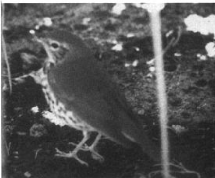
Wood Thrush at Zuni, New Mexico, October 7, 1996.

Corvids on the move included single Blue