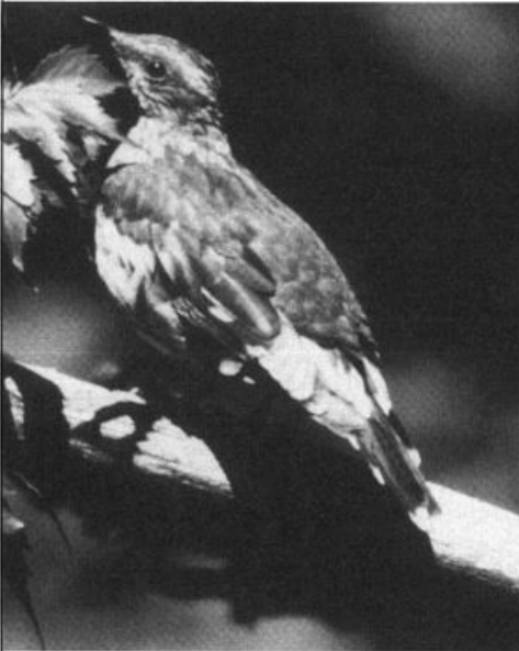
A remarkable invasion brought as many as twenty-one Aztec Thrushes to southern Arizona during the season. This was one of the birds in Miller Canyon, Huachuca Mountains, in early September.