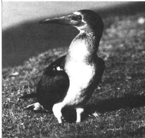
To the delight of birders, this Blue-footed Booby (photographed September 27, 1996) spent almost a month at a golf course at Laveen, Arizona.

Both Blue-footed Booby and Brown Booby were found in s. Arizona. It began with an unidentified booby seen at Canyon L., Sept. 14–17. When this bird was looked for Sept. 19, a Blue-footed Booby was found flying around the marina; this individual was seen again Sept. 20 (ph. SGa). A 2nd booby was seen sitting on a cliff Sept. 29–Oct. 20 ( vide SGa, ph.) which turned out to be a Brown Booby. Coincidentally, when the Blue-footed disappeared from Canyon L., a 2nd individual (or possibly the same?) showed up at a small golf course pond in s. Phoenix Sept. 25–Oct. 19 (m.ob., ph. TC, GHR), where it dazzled dozens of birders (as well as golfers) by plunge-diving for fish. A 2nd Brown Booby was picked up in w. Phoenix Sept. 7 ( vide SGa) and brought to a rehab center. There have been <10 previous records for each species in Arizona. The Neotropic Cormorant found in Tempe during the summer remained until at least Aug. 11 (PM, ph. SGa). Two Neotropics were seen again at the Granite Reef Picnic Area on the Salt R., Sept. 8 (SGa), and another was at Kino Springs near Nogales Sept. 28 (RP). An unusually high concen-