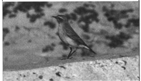
Near Marana, Arizona, October 29, 1996, this Northern Wheatear established a first state record.