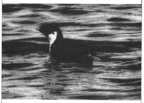
Proving once again that this is the species of alcid most likely to be found away from the ocean, this Ancient Murrelet was discovered at Pyramid Lake, Nevada, September 19, 1996.

Pyramid L., NV Sept. 19–25 (†BG, mob), the 2nd record for the lake.