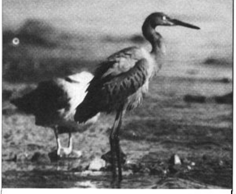
Furnishing a second record for Nevada was this Reddish Egret at Lake Mead on August 7, 1996.

Two imm. Red-throated Loons were reported from 2 different Colorado lakes this fall. One at Pueblo Res., Pueblo, Nov. 18-19 (†BKP) and the other at Holbrook Res., Otero, Nov. 24 (†MJ, BKP), Twenty-two Pacific Loons were reported from 7 Colorado counties this season, and one at Virginia L., near Reno, Washoe, NV Oct 21 (MM). On Oct. 21, 812 Com. Loons were observed at Walker L.e, Mineral, NV (LN). A single imm. Yellow-billed Loon was at Park Creek Res., Larimer, CO Nov. 27 (DAL, DCE, WPL, JFB). This species has become almost expected in fall or winter in Colorado. At Fish Springs N.W.R., Juab, UT from Aug. 7-Oct. 30, ≤43 Pied-billed Grebes were counted (JB, EG). Single Horned Grebes were at Pyramid L., Washoe, NV Sept. 14 and Walker L., Oct. 20 (GC), and two were at Quail Creek Res., Washington, UT Nov 16-30 (SS, PS, M&PD, JKr). A Red-necked Grebe was at Warren L., near Fort Collins, Larimer, CO Nov. 27-30 (DCE). Up to 11 Eared Grebes were at Fish Springs N.W.R., UT Aug. 7-Oct. 30 (JB, EG). High counts of W. Grebes at Pyramid L., NV, included approximately 500 Sept. 7 (MM) and 1599 at Union Res., Weld, CO Oct.15 (TL). Approximately 100 Clark's Grebes were at Pyramid L., NV Sept. 7 (MM) and one was at Quail Creek Res., UT Oct. 26 (SS). Up to 66 Am. White Pelicans were at Fish Springs N.W.R. from Aug. 7-Sept. 18 (JB, EG). An imm. Brown Pelican was observed at 3 Colorado locations;